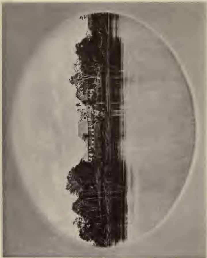
ASTANA, KUCHING. THE RESIDENCE OF THE RAJA.