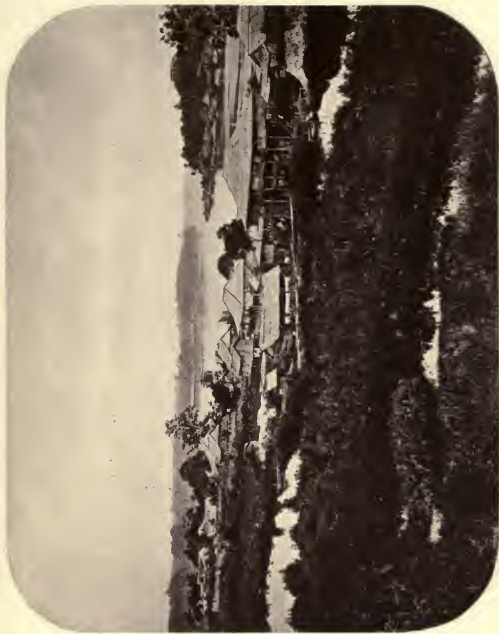
TOWN OF SINTANG. (DUTCH BORNEO.)