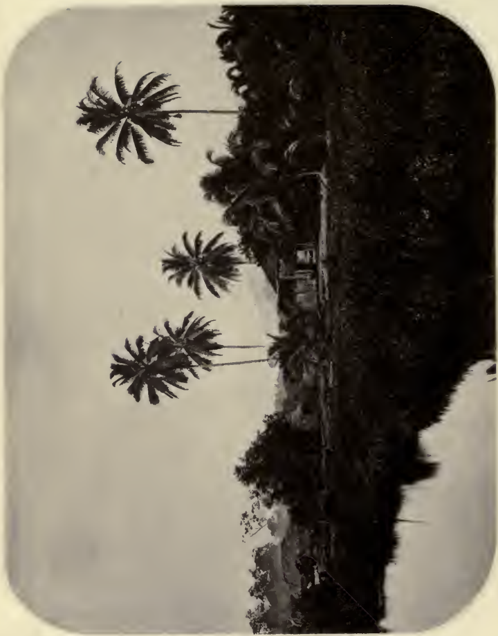
RIVER SCENERY NEAR DONG.