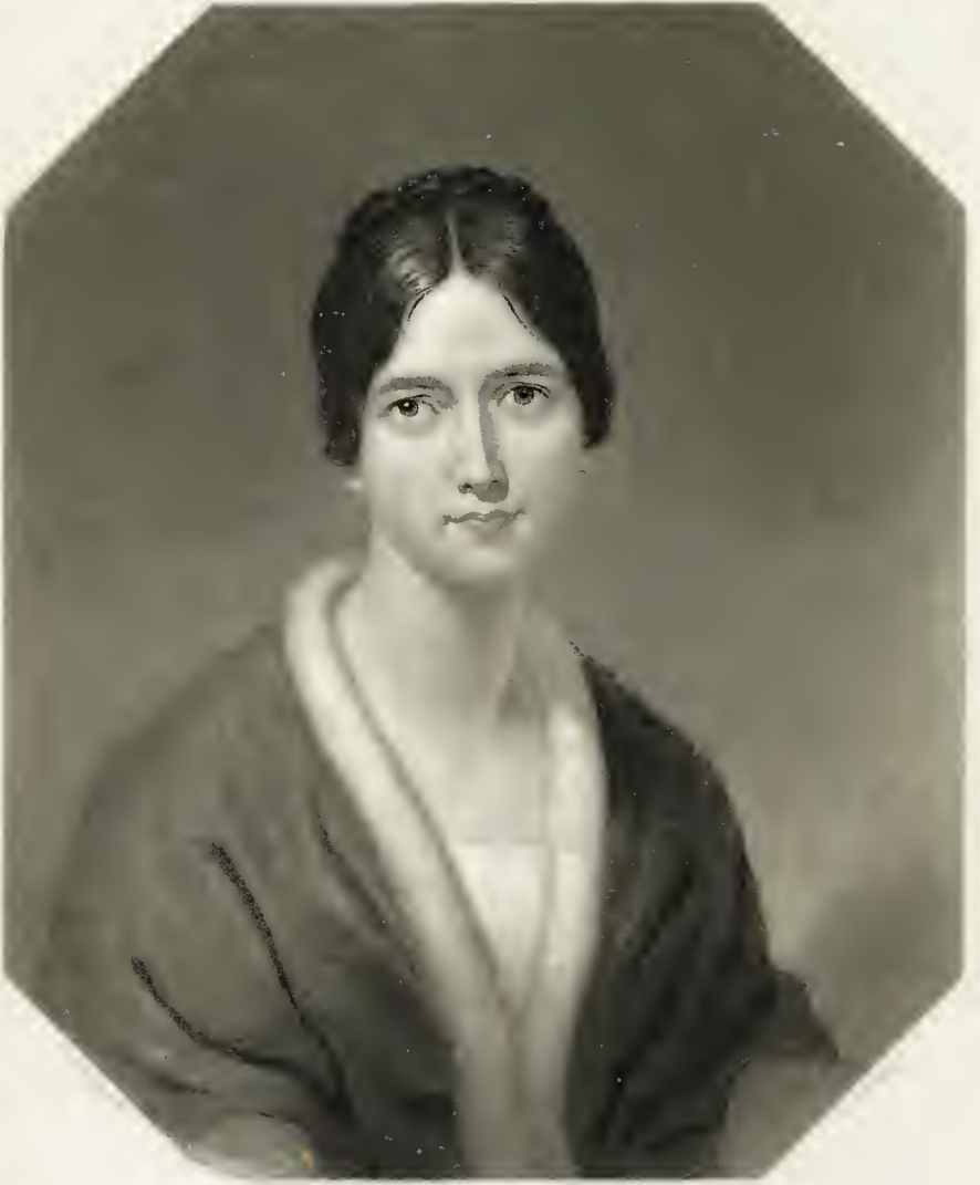
Frances S. Osgood.