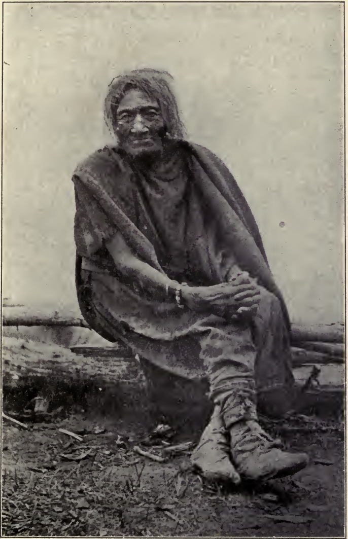
SHEEP EATER SQUAW 115 YEARS OLD "THE WOMAN UNDER THE GROUND"