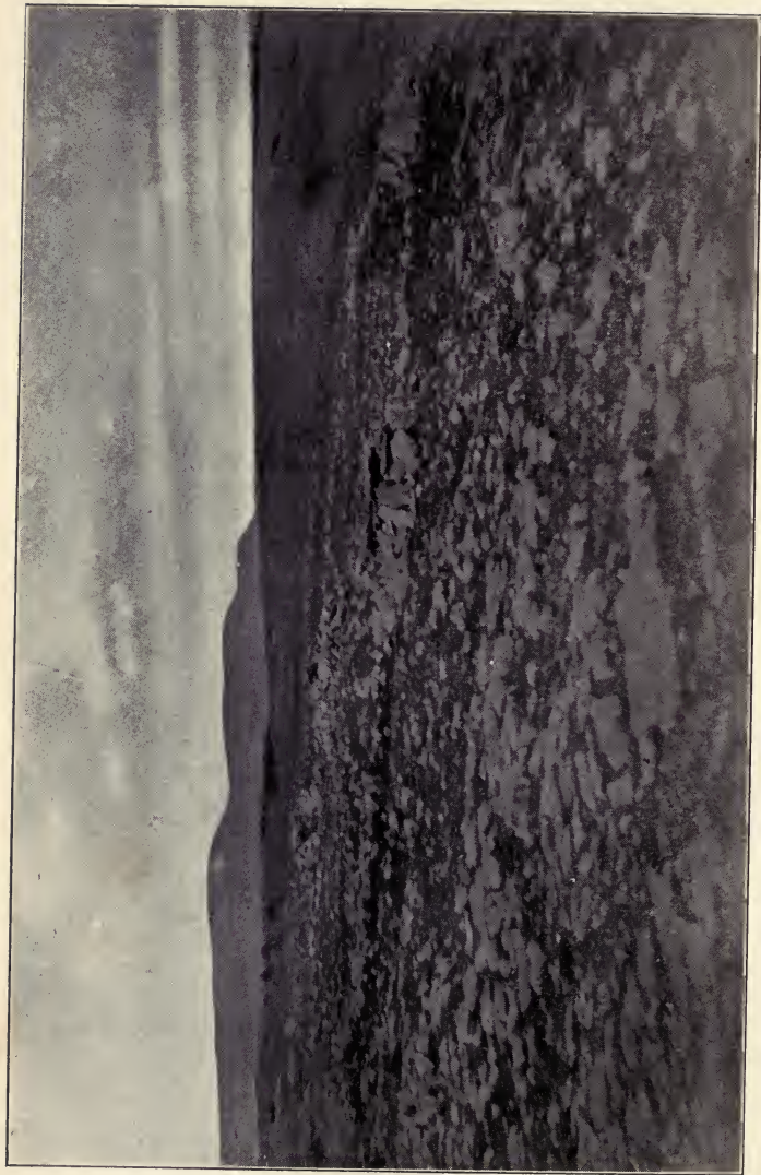
WHEEL OF THE HOLY SHRINE, BALD MOUNTAIN, WYO.