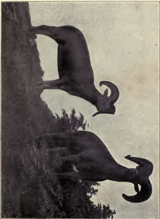
ROCKY MOUNTAIN BIG HORN