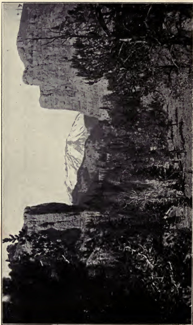
SHEEP EATERS PASS TO THE HOLY SHRINE