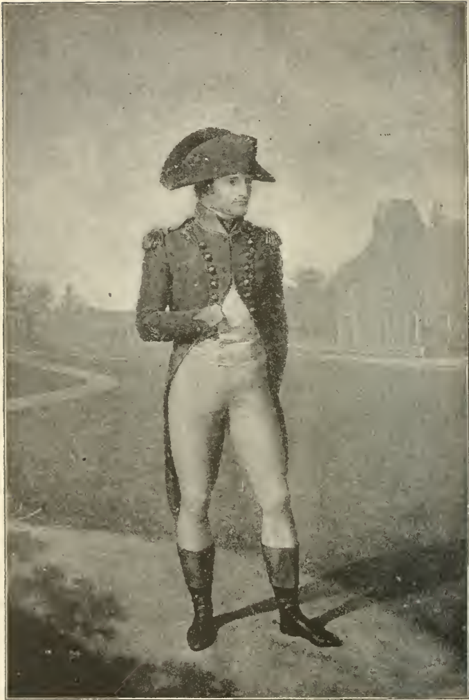
NAPOLEON AT MALMAISON.