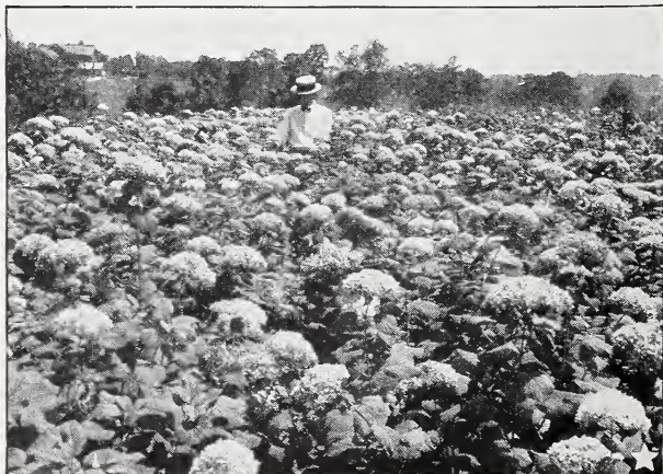
Hydrangea Arborescens Grandiflora —the popular "Hills of Snow."

2 1/4-in. pots..... $1.00 $7.00 $60.00 1-year..... 2.00 15.00 125.00 2 to 2 1/2 ft..... 2.75 22.00 200.00 3 to 4 ft..... 4.00 35.00 300.00