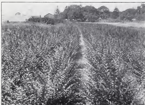
Beautiful 2 to 2½ ft. Ibolium Privet .