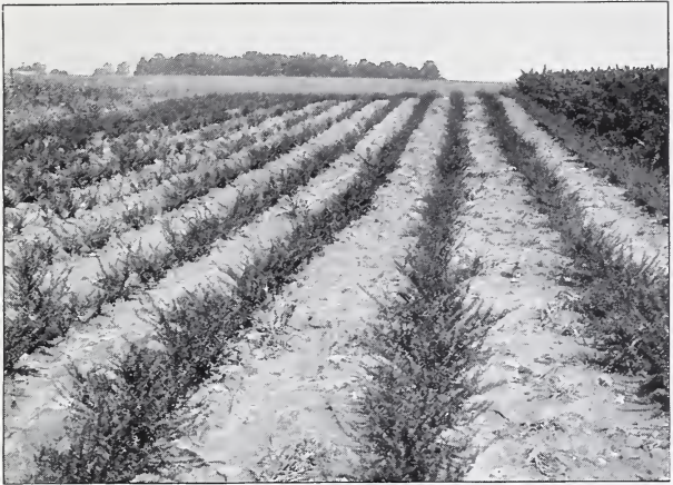
Truly representative of Box Barberry , the hardy border-plant.