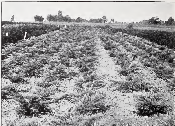
Juniperus Pfitzeriana —1 to 1½ ft.—at a dollar (with B. & B.) see Page 5

JUNIPERUS sabina tamariscifolia. Tamarix Savin Flat, spreading growth, making compact but soft texture in low evergreen planting. 10 100 1,000 8 to 10 in. B. & B..... $6.00 $50.00 1 to 1½ ft. B. & B..... 20.00 150.00