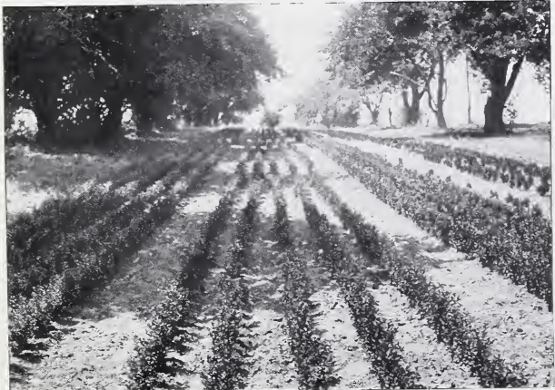
Think of the places where you can use this Buxus Sempervirens (Common Box)