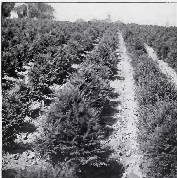
Retinospora Plumosa —nice shapely plants at new low prices. (See below)