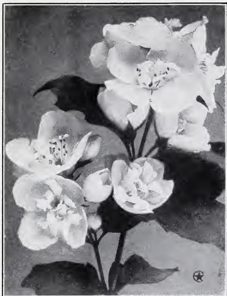
Typical bloom of Philadelphus Virginal . Still holds first place as the most beautiful variety of its class (see next page).