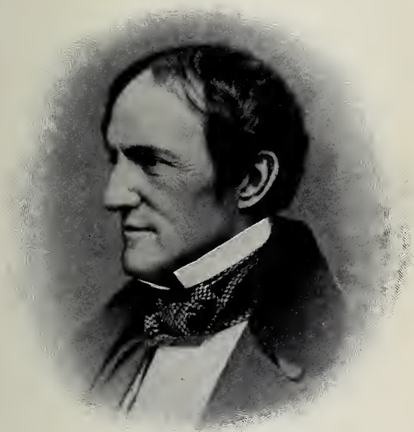
WILLIAM H. PRESCOTT.