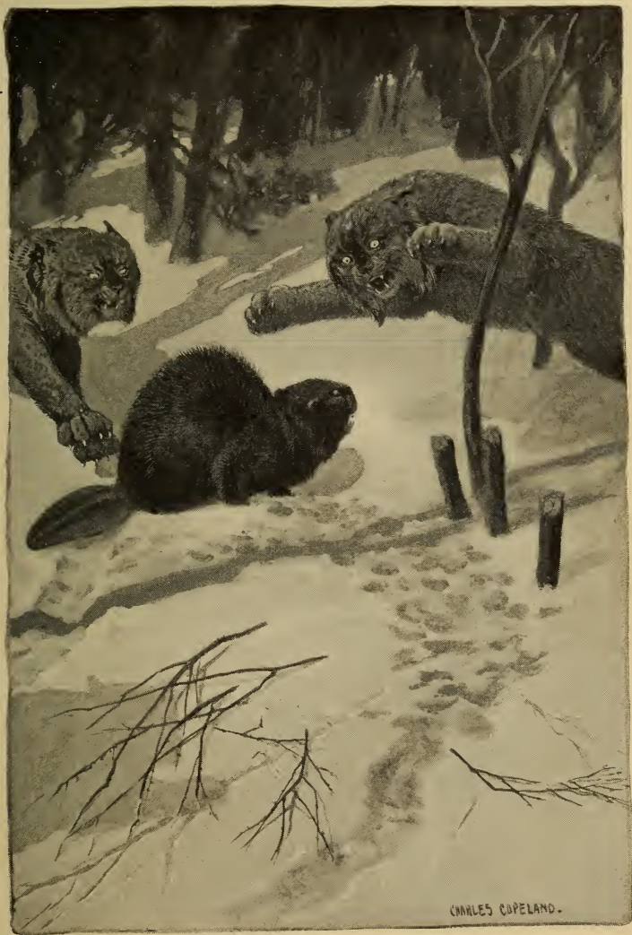
THERE IS WHERE THE HUNTER AND THE HUNTED MET