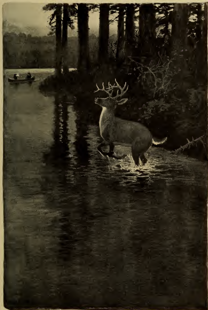
THE BUCK GAVE A MIGHTY LEAP AND FELL MIDWAY IN THE STREAM