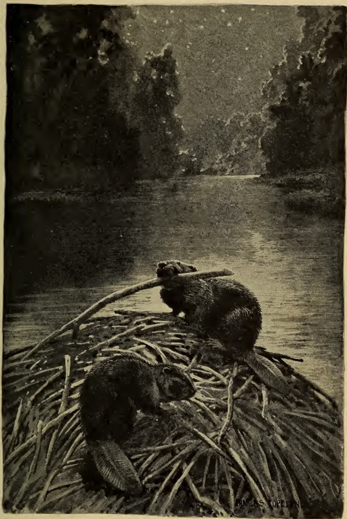
THE FINAL TOUCHES WERE PUT UPON THIS CURIOUS DOME-SHAPED HOUSE