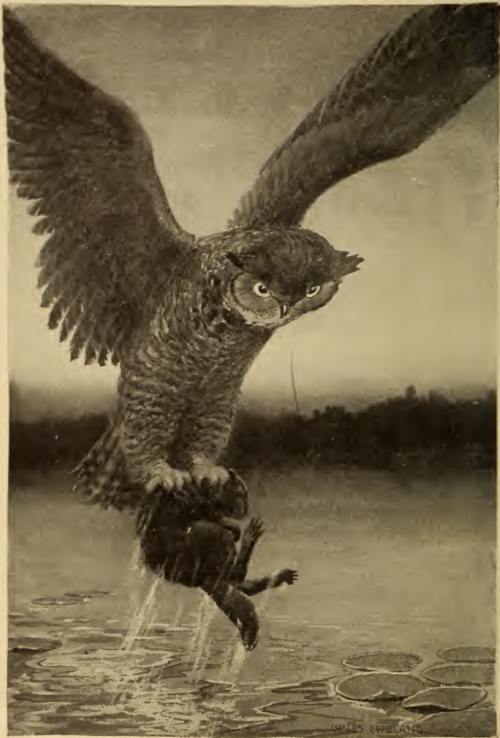
REACHED DOWN AND GRIPPED HIS BROTHER