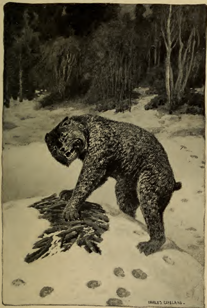
TEARING AT THEIR HOUSE AND FILLING THE NIGHT WITH AWFUL SOUNDS