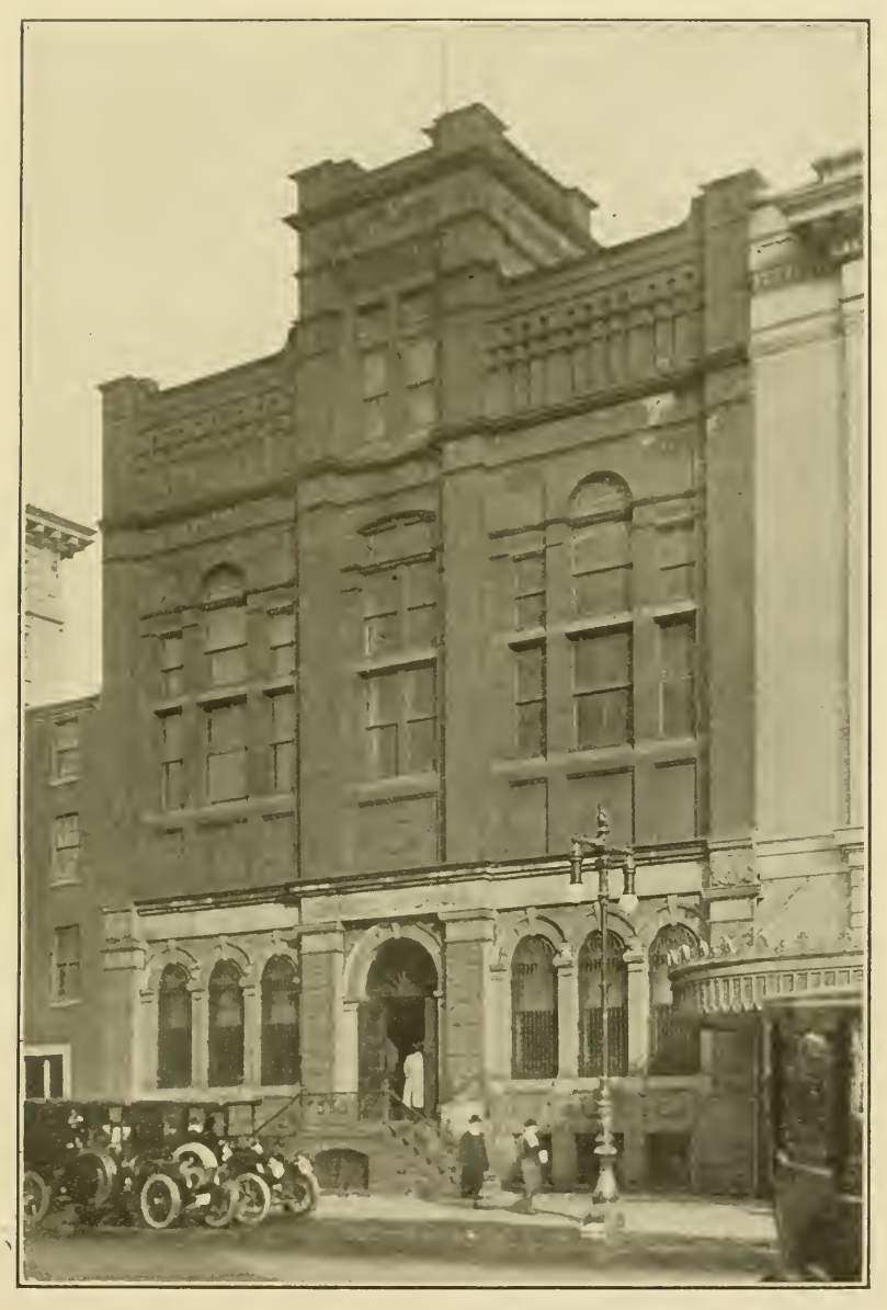
Armory-State Fencibles Broad and Race Streets, Philadelphia.