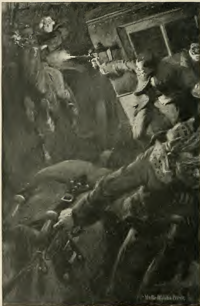
THE ANSWER WAS A BLINDING FLASH OF LIGHT AND A SHOT P. 188