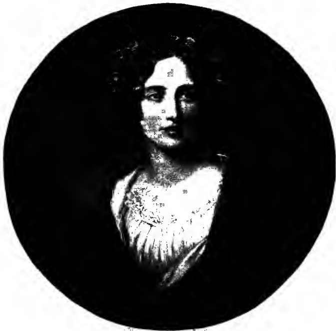
Catherine Gladstone from a painting.