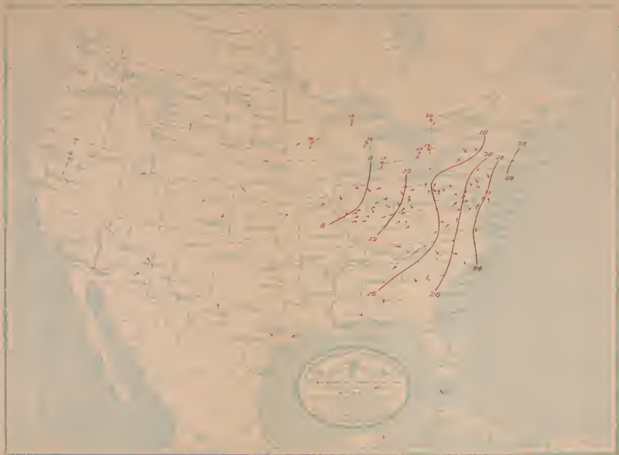
Chart B—Thunder-Storms May 19, 1884.

Full lines show lines of general action at 4 a. m., 5 a. m., 12 (noon), 14 (2 p. m.), 4c.