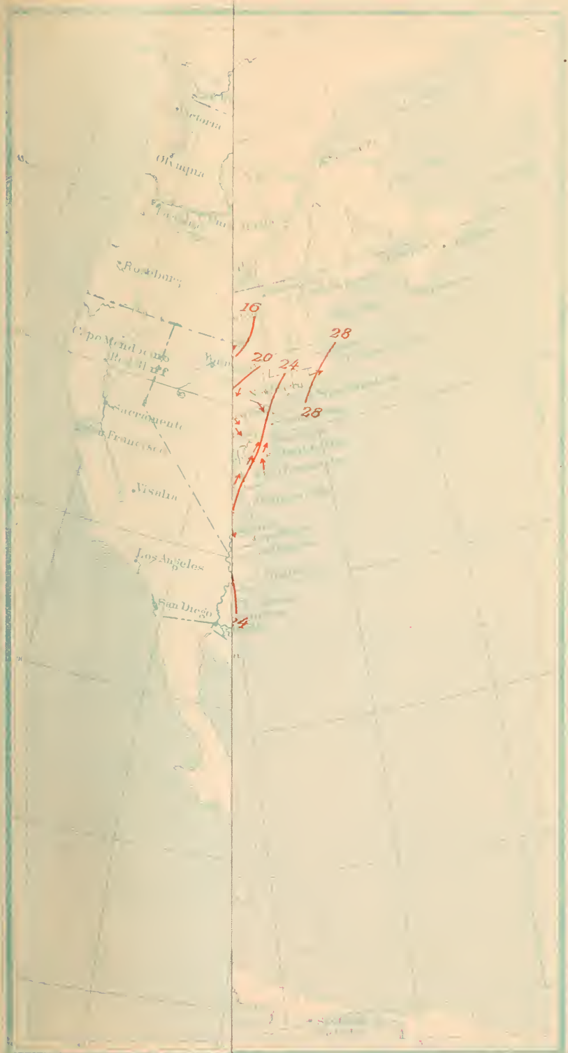
Full curves show lines of general action, 7 a. m.); 18-2 (18th, 3 p. m.); 18-3 (18th, 3 p. m.), &c