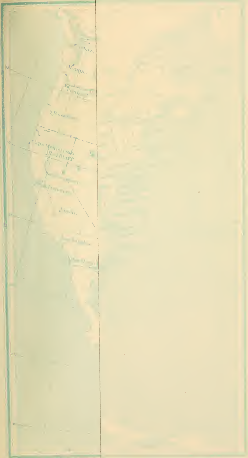
Full curves show lines of general alt. (18th, 7 a. m.); 18-2 (18th, 3 p. m.); 18-3 (18th, 3 p. m.), &c.