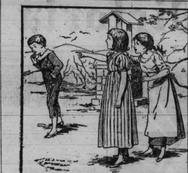
MOTHER GOOSE PUZZLE. When Tommy Green drowned the cat the girls told his parents. Find his father and mother.