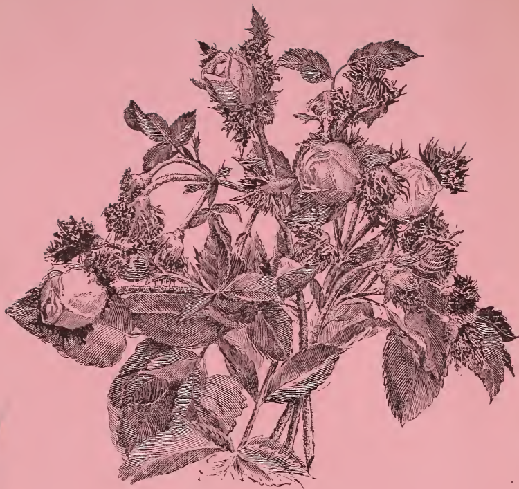
CRESTED MOSS. ( \frac{1}{2} NATURAL SIZE.)

SPECIAL MERITS.—Long fringe-like moss, giving the buds a unique and very beautiful appearance.