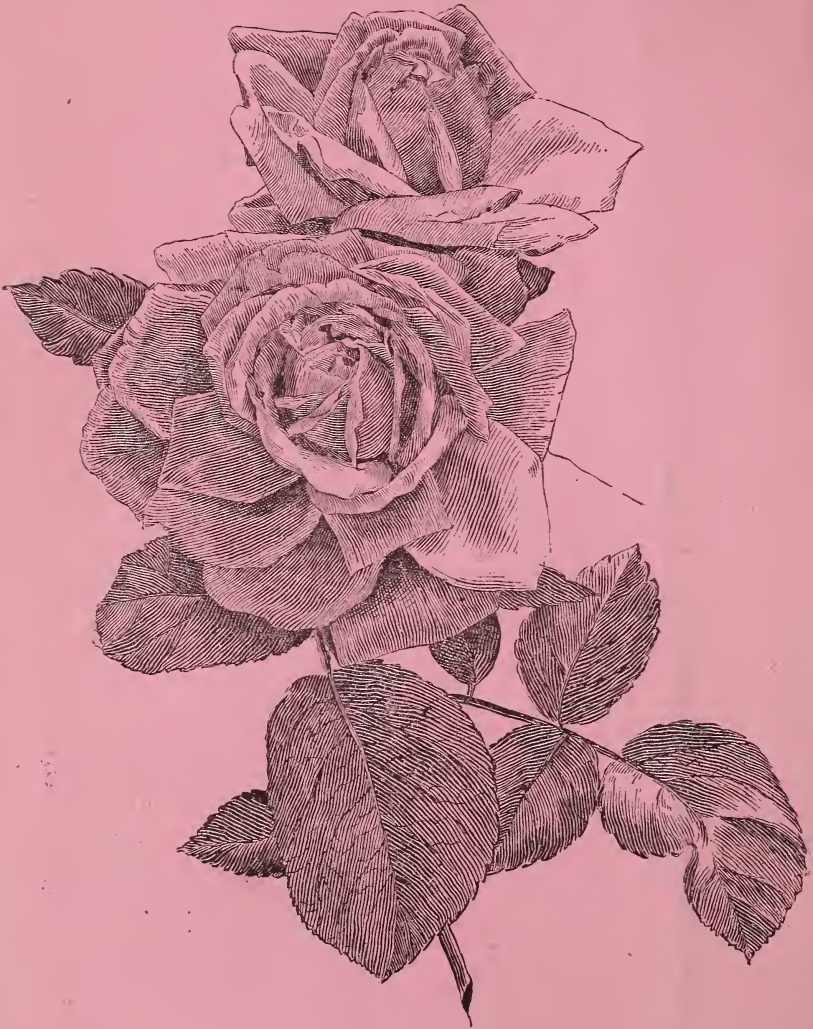
EUGENIE VERDIER. ( \frac{3}{4} NATURAL SIZE.)

SPECIAL MERITS.—Delicacy of color ; fine buds ; very valuable for forcing.