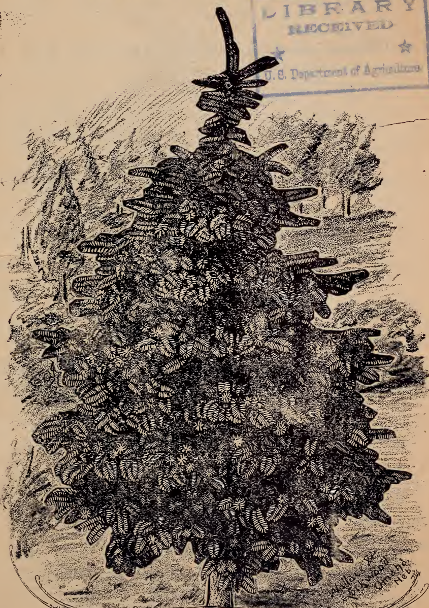
PICEA PUNGEN Colorado Silber

LIBRARY RECEIVED U. S. Department of Agriculture