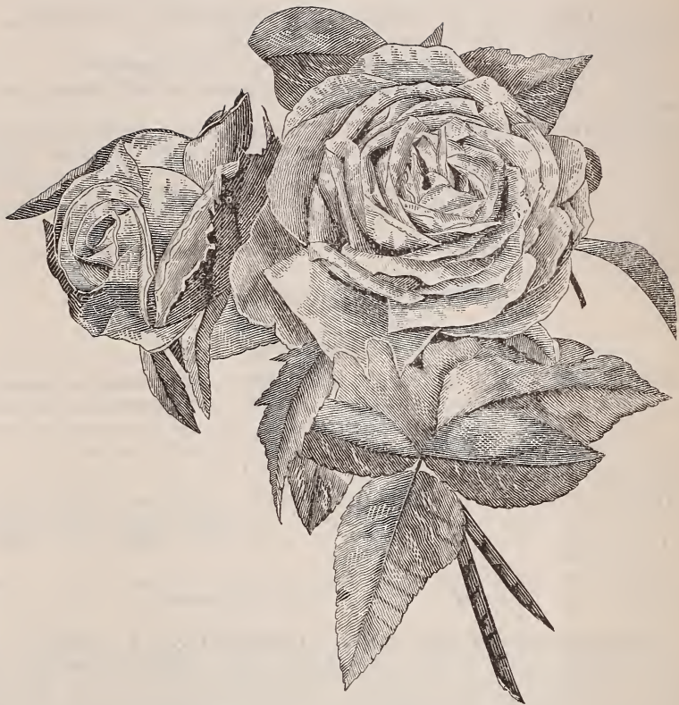
COUNTESS OF SERENYE. ( \frac{2}{3} NATURAL SIZE.)

SPECIAL MERITS.--Great beauty of form, when in perfection: delicate mottled appearance; utility for forcing and as an Autumnal Rose.