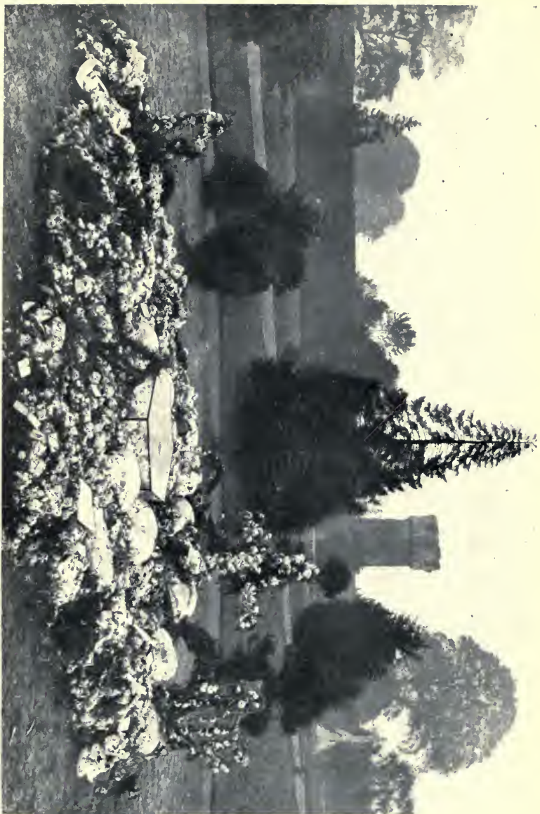
PARNELL'S GRAVE AT GLASNEVIN AFTER THE INTERMENT