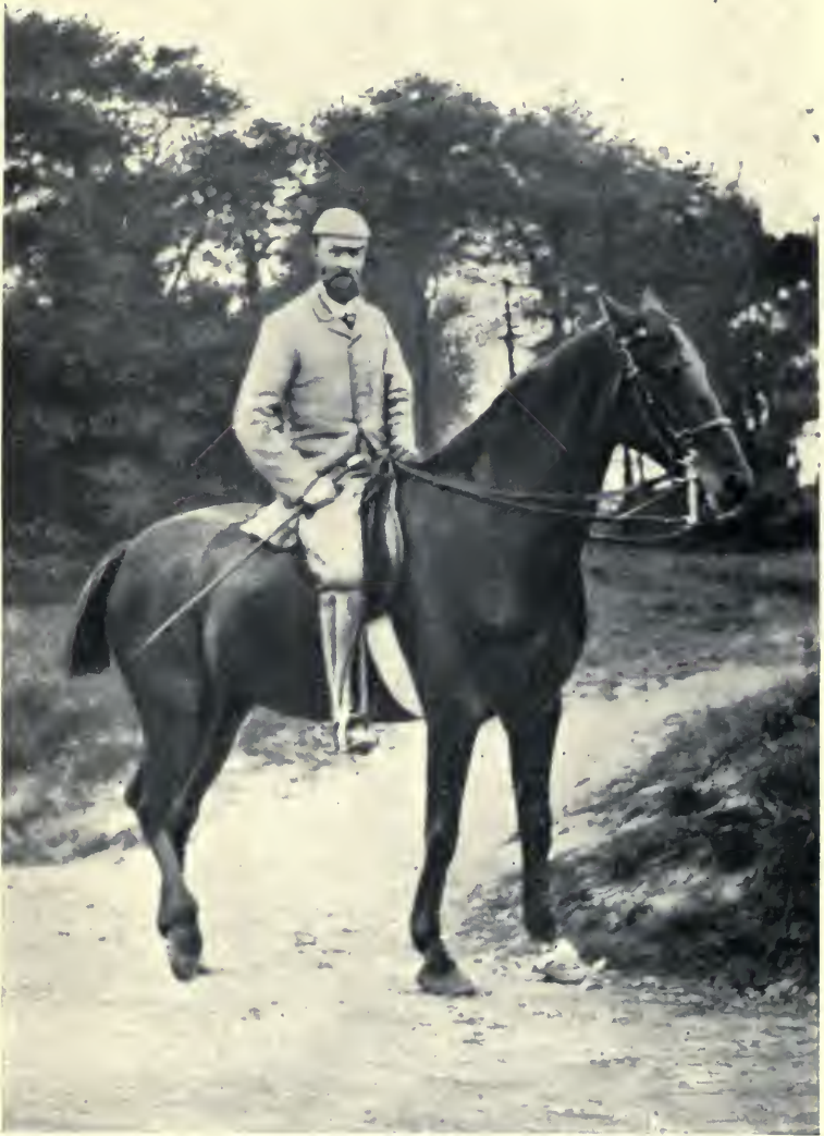
MR. PARNELL ON HORSEBACK