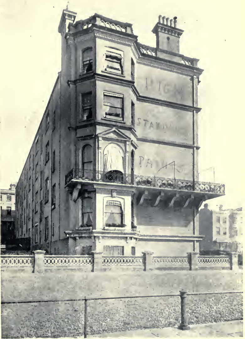
8 MEDINA TERRACE, HOVE