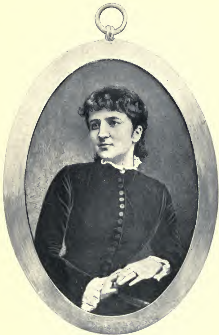
" MRS. PARNELL IN 1880

This portrait was coloured for Mr. Parnell and always carried by him until his death. He had it with him in Kilmainham