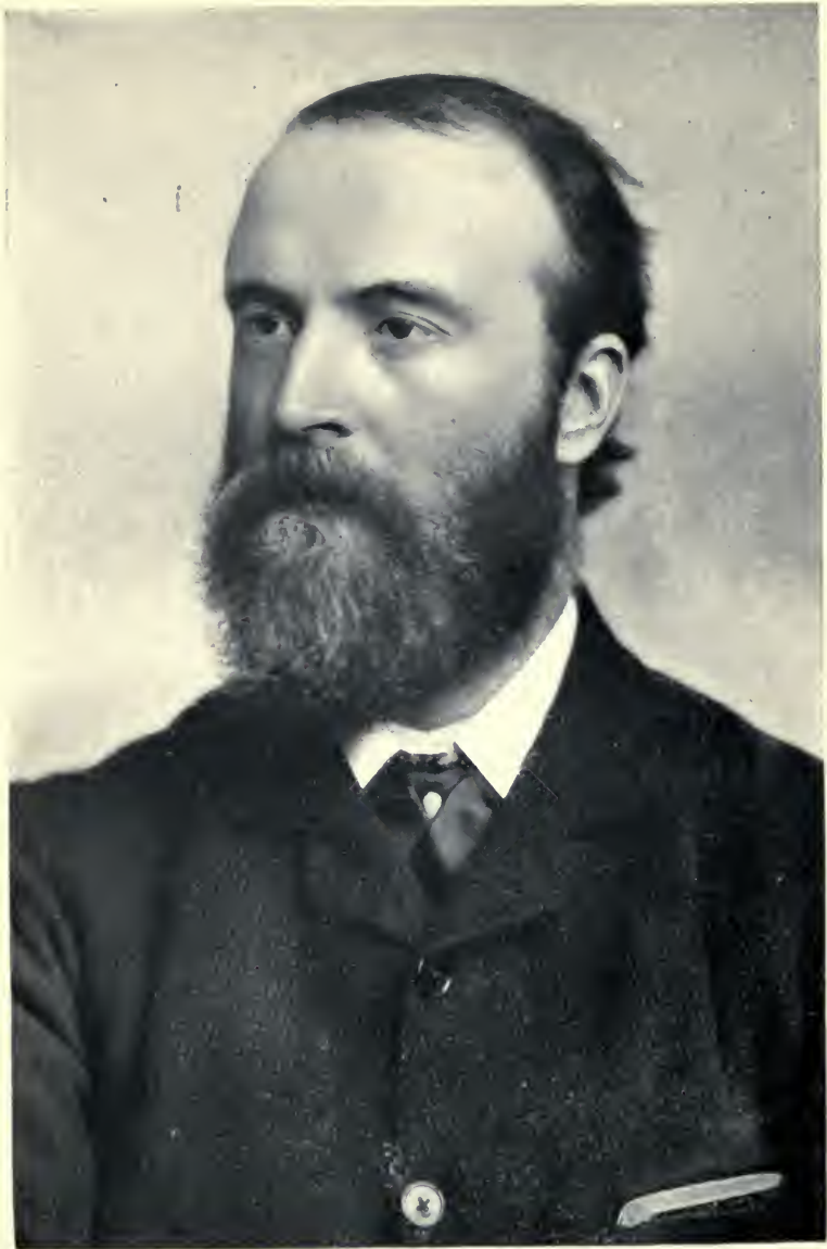
MR. PARNELL IN 1886