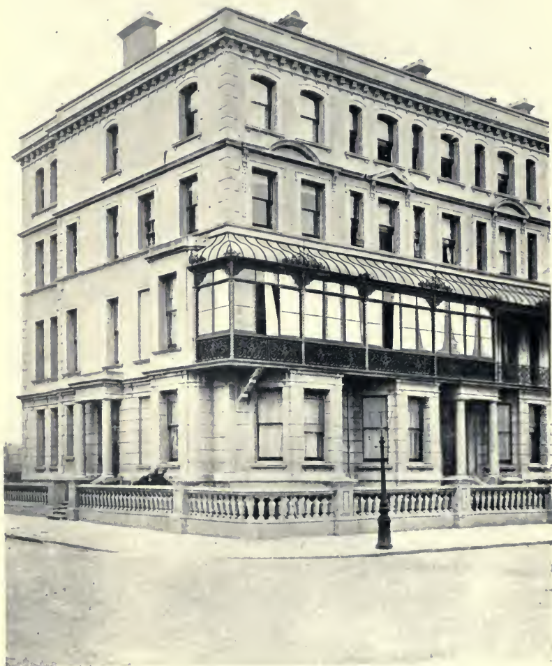
THE HOUSE WHERE PARNELL DIED 10 Walsingham Terrace, Brighton