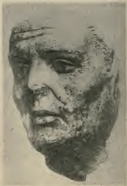
M. TULLIUS CICERO. FROM THE JAMES LOEB COLLECTION.