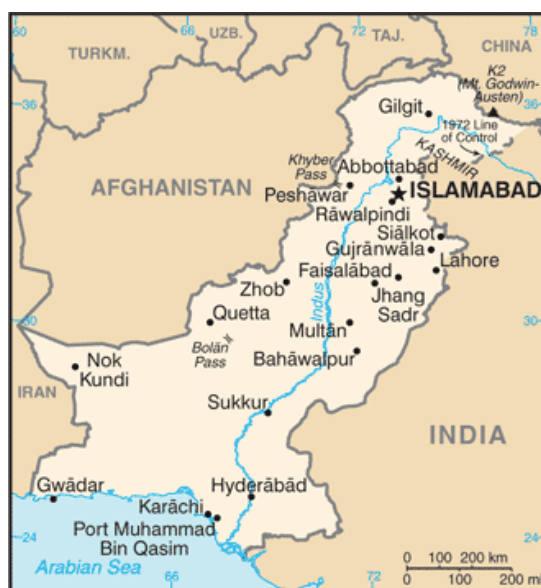
Figure 2. Map of Pakistan and Region 85

Pakistan's position at the crossroads of central and south Asia, as well as its proximity to the Persian Gulf and Middle East make it a strategically important location with respect to U.S. interests on the far side of the world (see figure 2). South Asia in general is an area with few socio-cultural ties to the U.S. and sit in vastly differing political arenas. While Pakistan sees itself as a world player with significant contribution to the global structure, U.S. policies are generally directed toward short term objectives in the region. A review of the back and forth history of the relationship between these two states shows that both their foreign policies are accurately characterized as “largely based on self-serving reasons rather than mutually congruent objectives.” 84