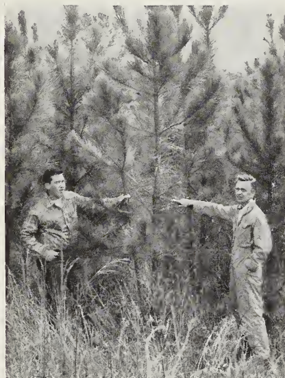
A 4-H program encourages tree planting on eroded land.

A score card is used in determining winners. This gives weight to the method of planting the seedlings, percentage of seedling survival, and timber-stand improvement practices carried out.