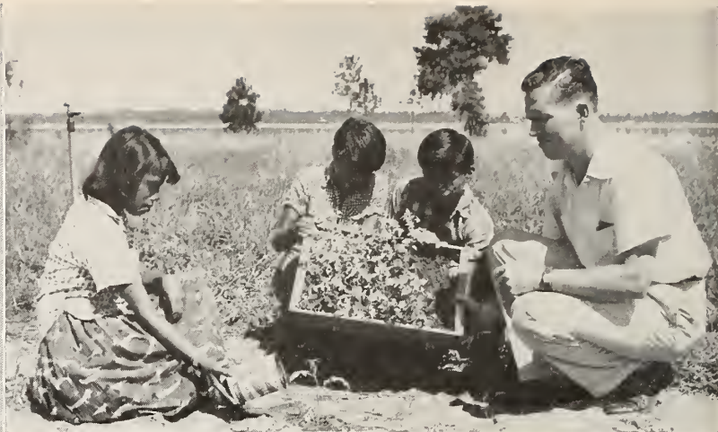
At their first camp, Seminole Indian 4-H Club members are shown how to start garden plants.