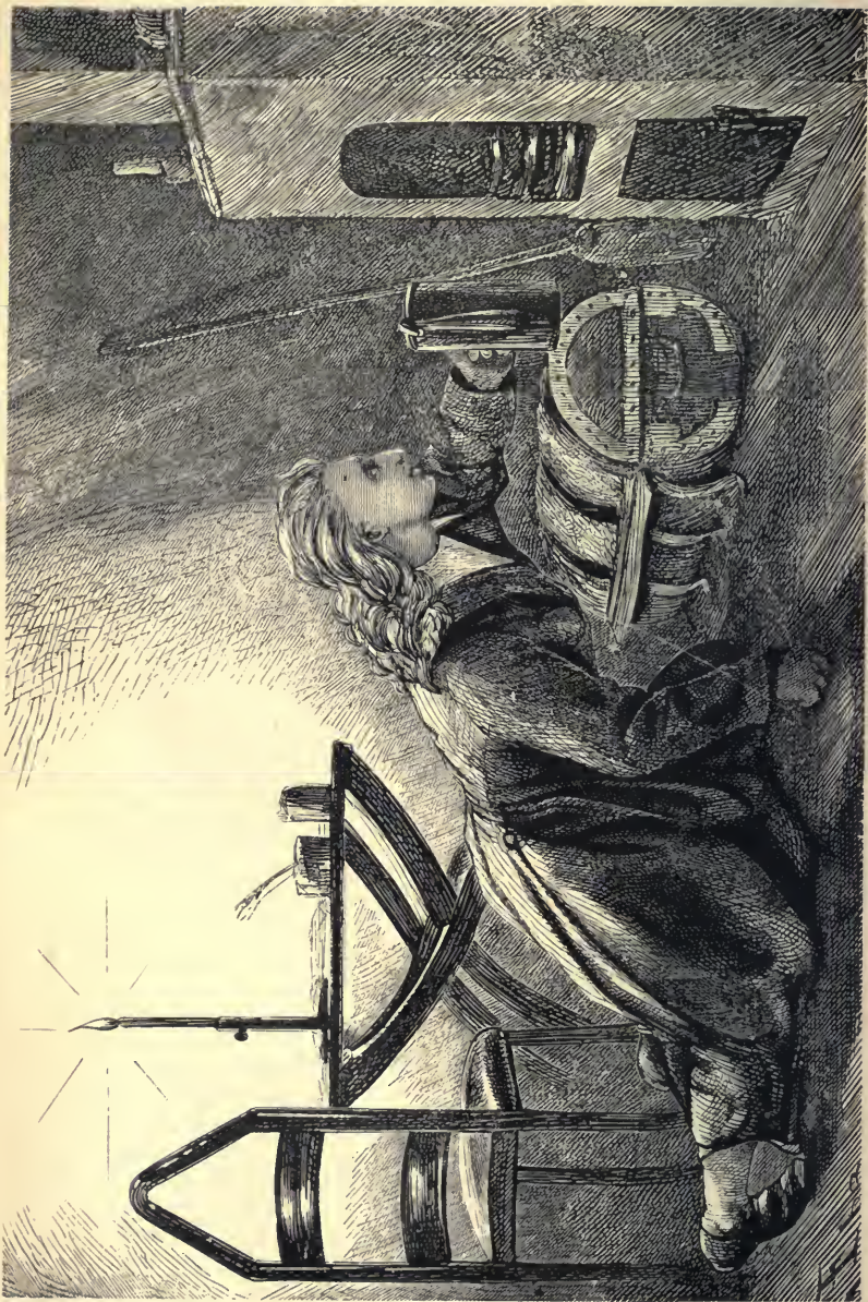
SCHILLER IN HIS ATTIC.