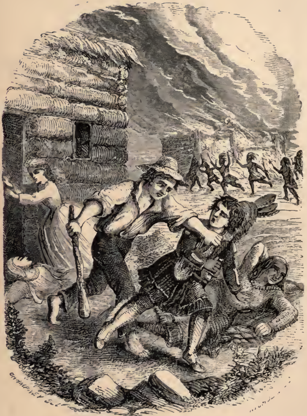
THE CAPTURE OF THE INDIAN BOY.