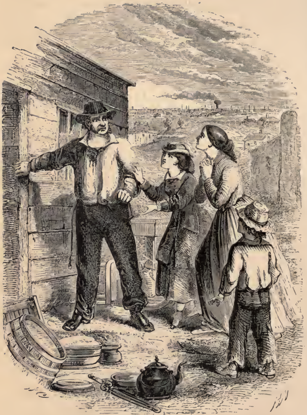
THE CRUEL LANDLORD.