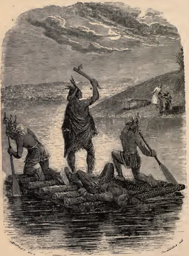
THE NIGHT ATTACK.