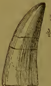
FIG. 1.—Tooth of Avalonia Sanfordi , Seeley.