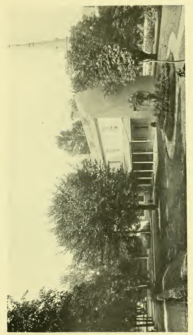
THE SHIPPEN HOUSE--REAR VIEW