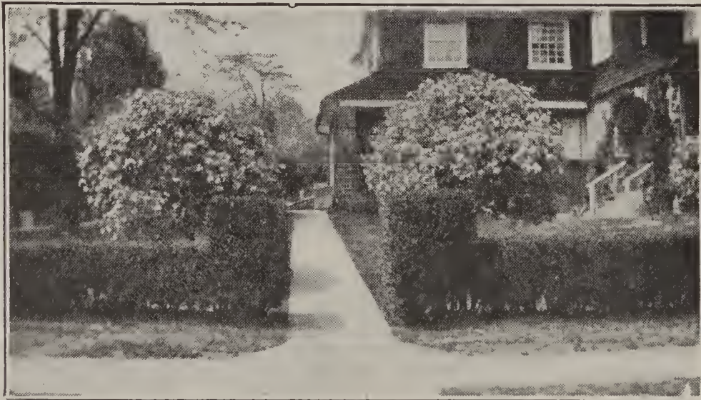
MALUS ATROSANGUINEA, CARMINE CRAB