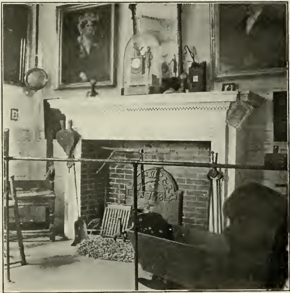
A CORNER OF THE MUSEUM OF THE NEWPORT HISTORICAL SOCIETY