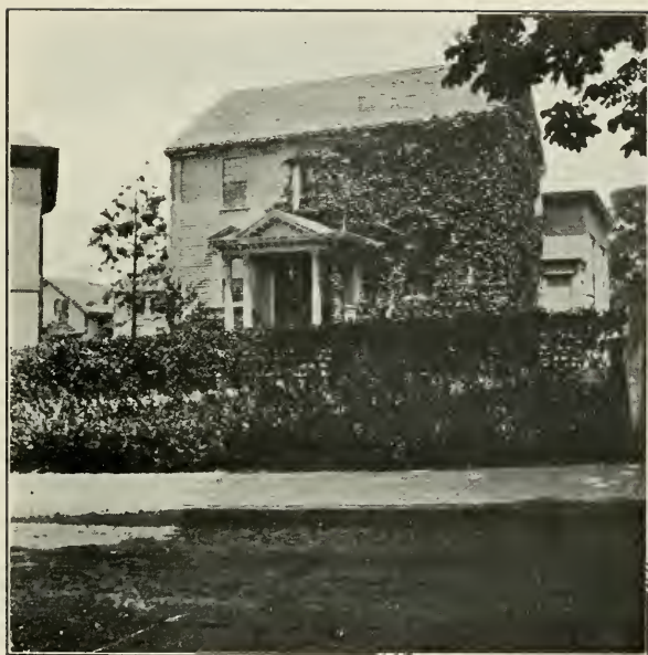
ORIGINAL SEVENTH DAY BAPTIST MEETING HOUSE ERECTED 1720 NOW THE MUSEUM OF THE NEWPORT HISTORICAL SOCIETY