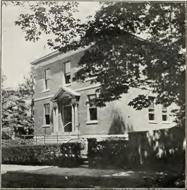
LIBRARY OF THE NEWPORT HISTORICAL SOCIETY ERECTED 1902