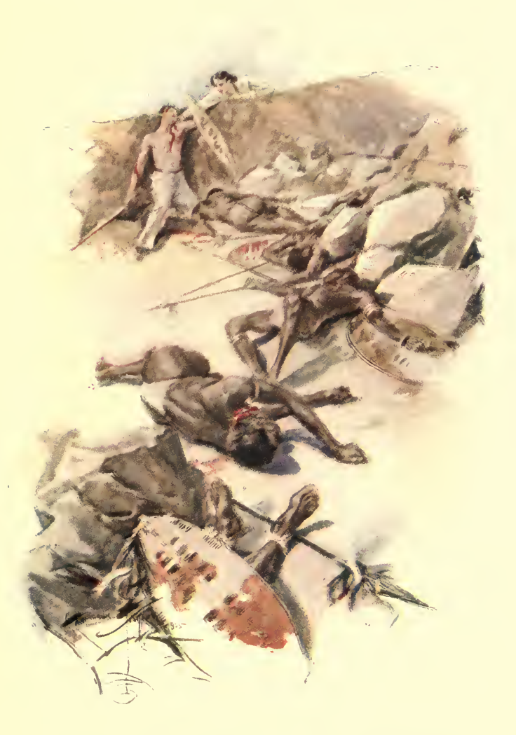
"THEY HAVE KILLED YOU! LET THEM KILL ME!"