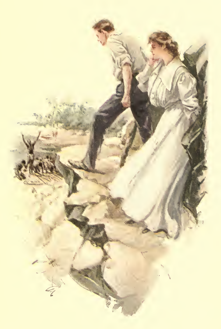
"HEY, THERE! HE YELLED, HOW ARE YOU?"