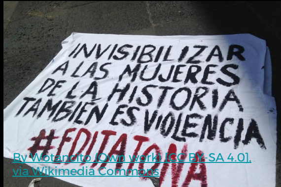
By Wotanito (Own work) [CC BY-SA 4.0], via Wikimedia Commons