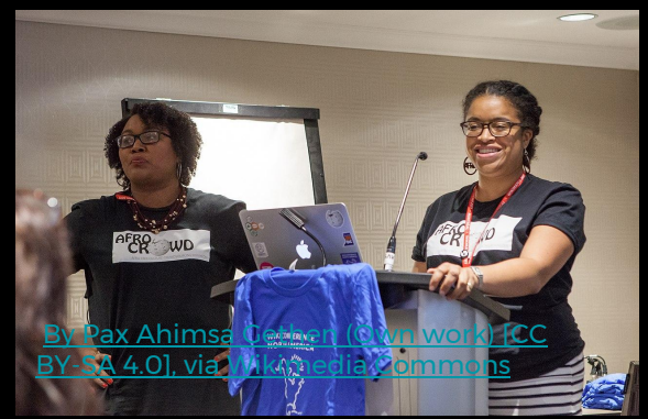
By Pax Ahimsa (Own work) [CC BY-SA 4.0], via Wikimedia Commons