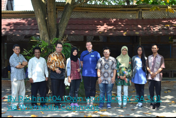
By Rachma04 (Own work) [CC BY-SA 4.0], via Wikimedia Commons