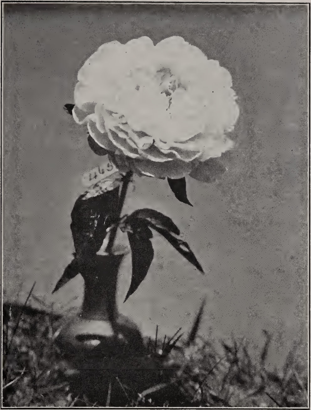
Naomi (Auten, 1933) a soft pink double $5.00