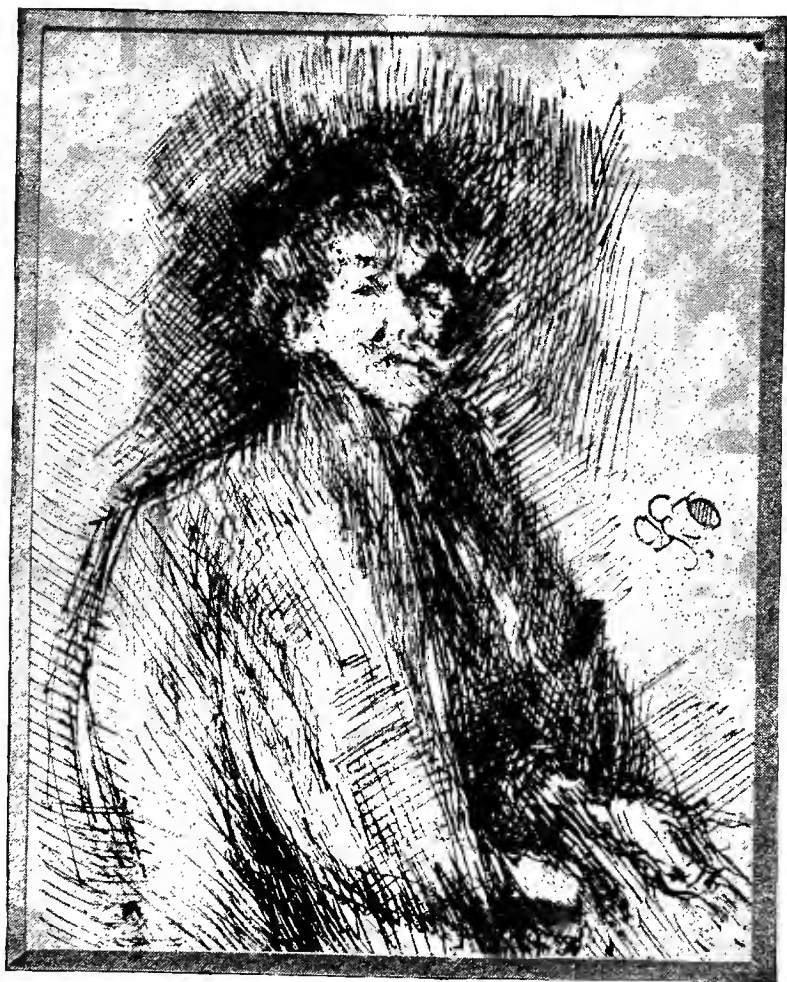
PORTRAIT OF J. M. N. WHISTLER

PEN DRAWING BY THE ARTIST. NO. 279 IN THE CATALOGUE