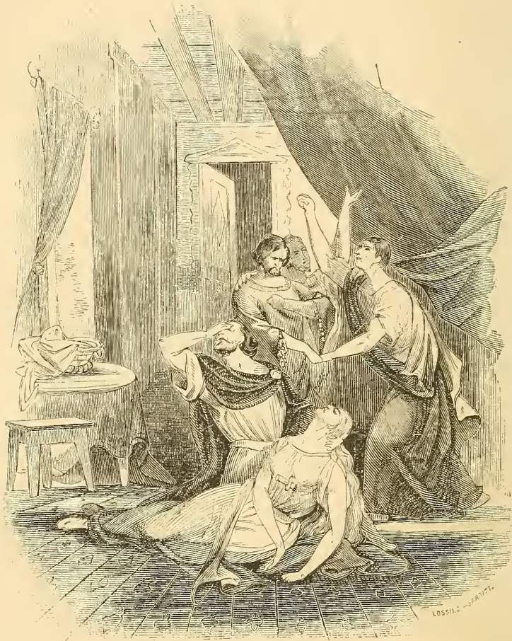
BRUTUS AND HIS COMPANIONS.