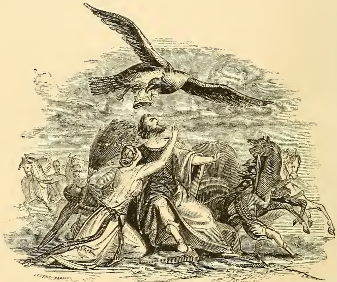
THE OMEN GRANTED TO TARQUINIUS PRISCCS.