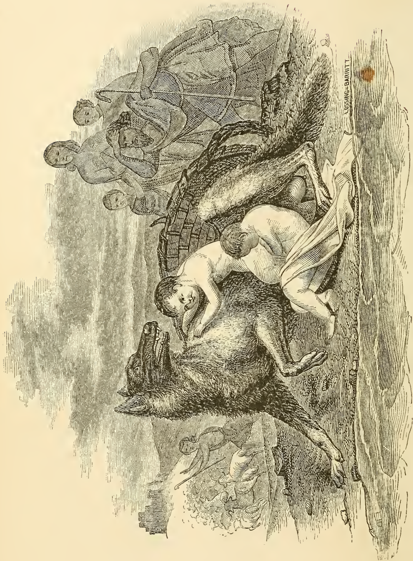
DISCOVERY OF ROMULUS AND REMUS.