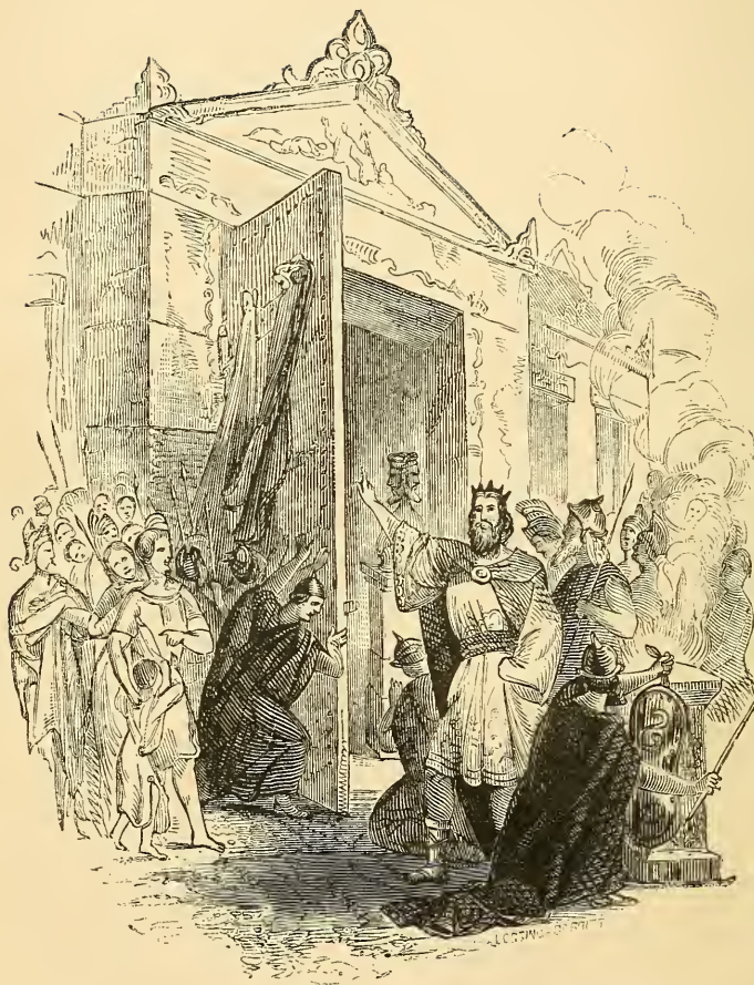
NUMA CLOSING THE TEMPLE OF JANUS.