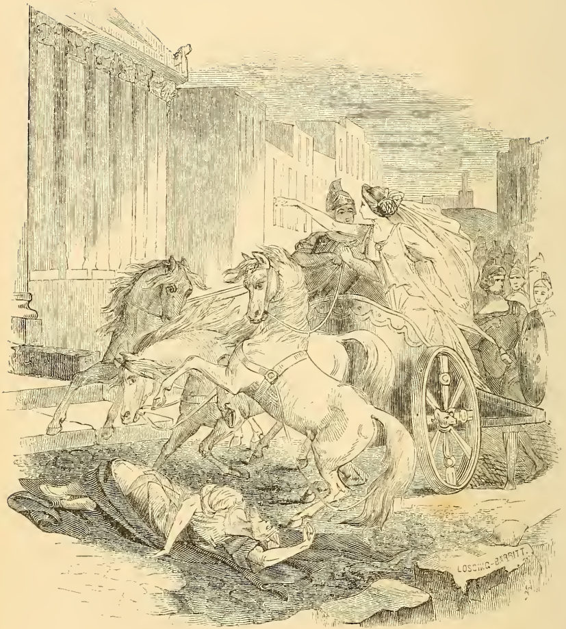
TULLIA DRIVING OVER THE DEAD BODY OF HER FATHER.