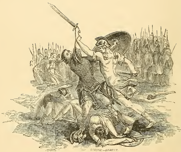
FIGHT BETWEEN THE HORATII AND THE CURATII.