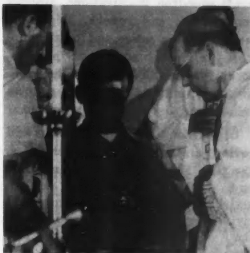
CHRISTMAS MASS — Archbishop Terence J. Cooke, Military Vicar of United States Armed Forces, conducts Midnight Mass in Vietnam.