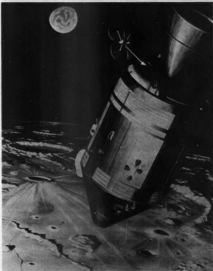
MOON AHEAD —Artist's concept shows Apollo 8 spacecraft, its nose pointed down toward the lunar surface, as it photographs the Moon and makes landmark sightings and other observations. A cutaway section shows one of the astronauts at work. Apollo 8 completed a successful six-day lunar trip Dec. 27.

The Phase II satellites are to be provided with sufficient on-board fuel supply to keep them on station, virtually motionless in the sky as an earthly observer is concerned—"with sufficient fuel to allow each satellite to be moved several times during its life from one equatorial longitude position to another. So, when the next bit of trouble breaks out on the other side of the world, that's one piece of equipment we won't have to airlift.