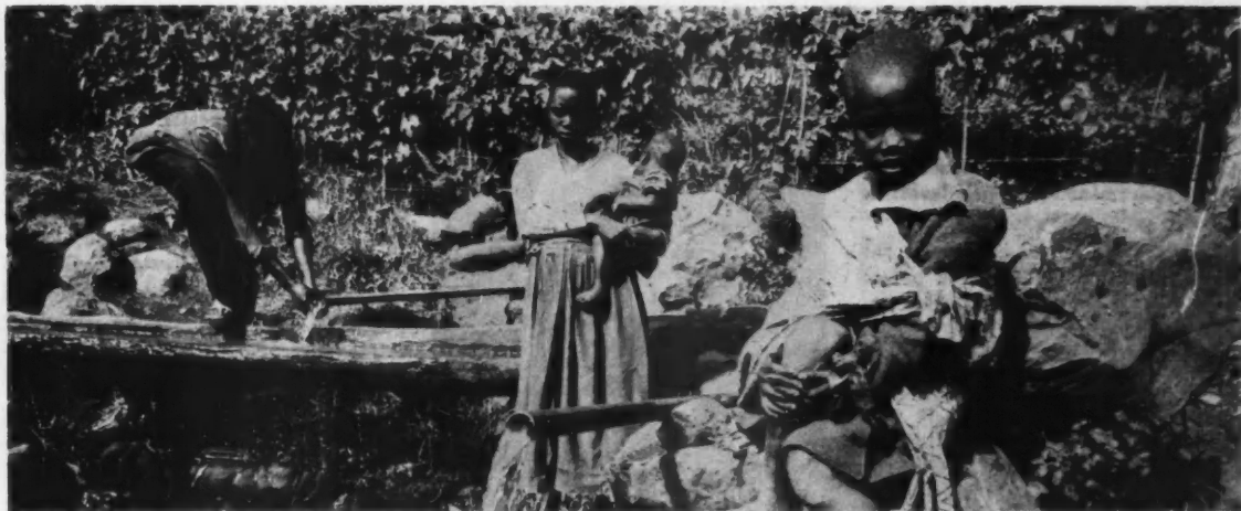
In Kenya a pumping station at Kamarin provides water for these dugout log outlets used by farmer and his family.

ing in cooperation on specific common developmental problems.