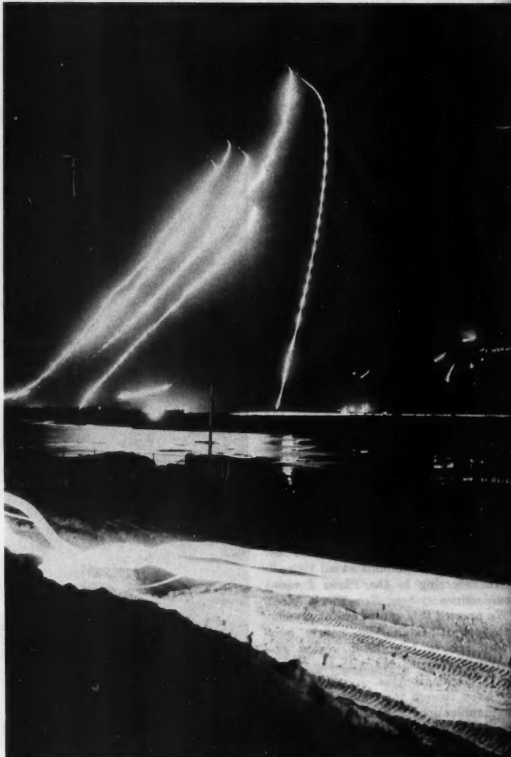
FLARES AT NIGHT —South Vietnam skies are illuminated to ward off potential Viet Cong attackers. Photo was taken by time exposure from edge of Marine Force Logistics Compound near Da Nang.

to, "a considerable, and I believe growing, group in the Soviet government which sees, as we do, that an arms race has no winners and that therefore they would be better off if they negotiated some sort of in-step deescalation."