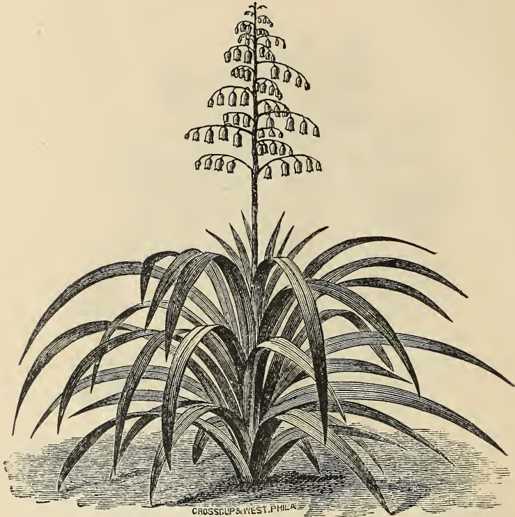
YUCCA FILOMENTOSA. —(See page 27.)