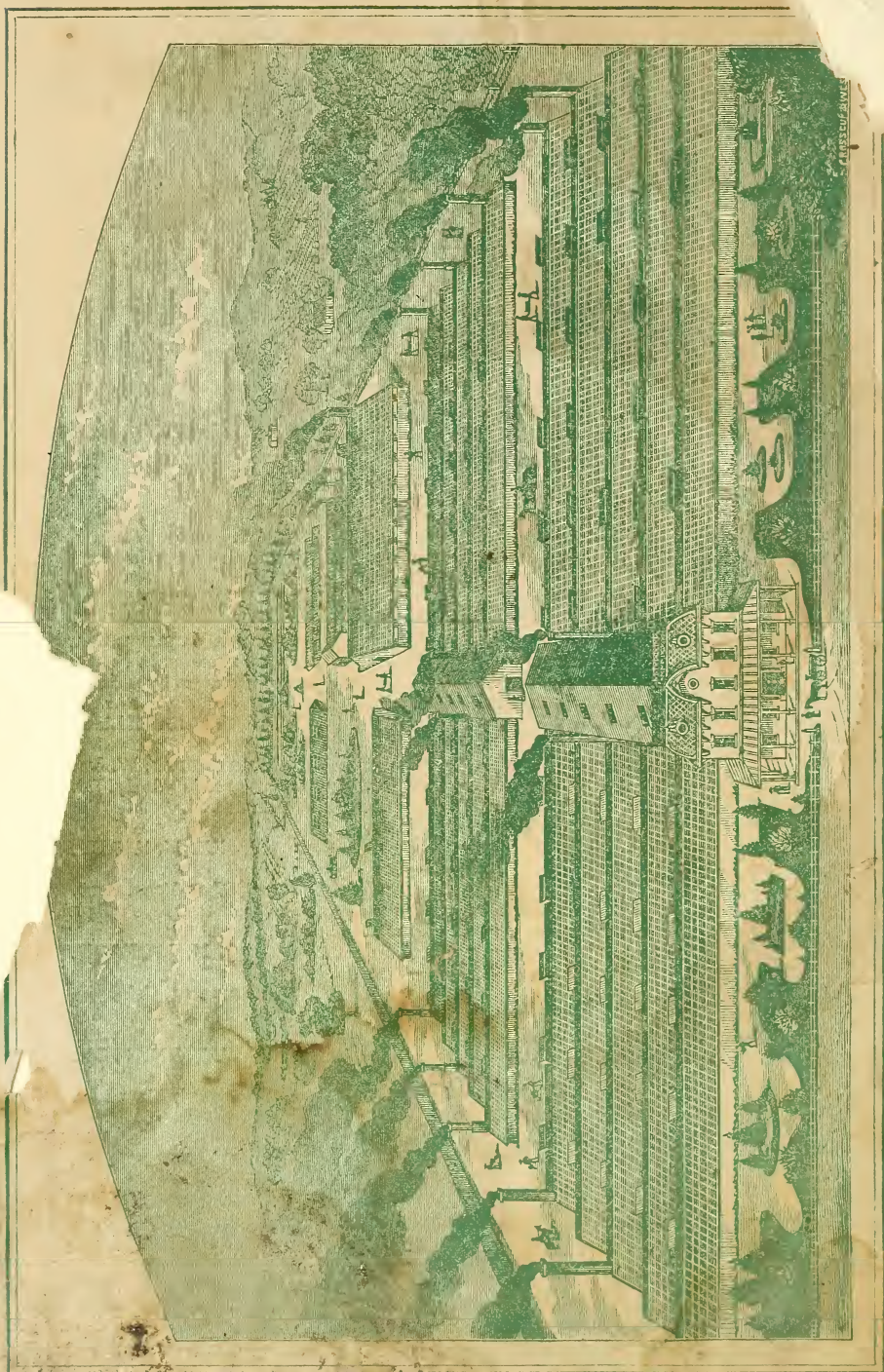
PARTIAL VIEW OF THE ROSE HOUSES OF THE DINGEE & CONARD COMPANY, WEST GROVE, PA