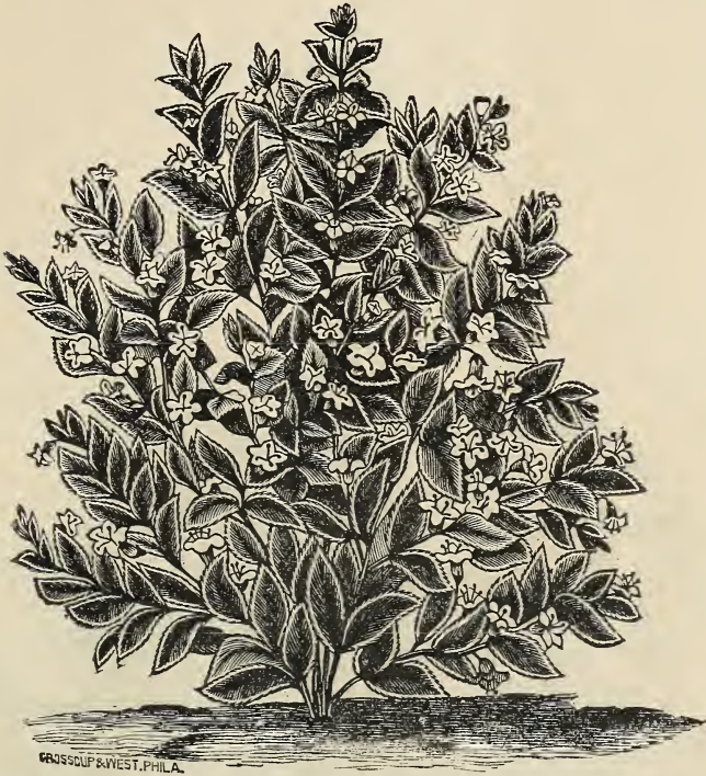
WEIGELIA ROSEA, VARIEGATED LEAVED. —(See page 27.)