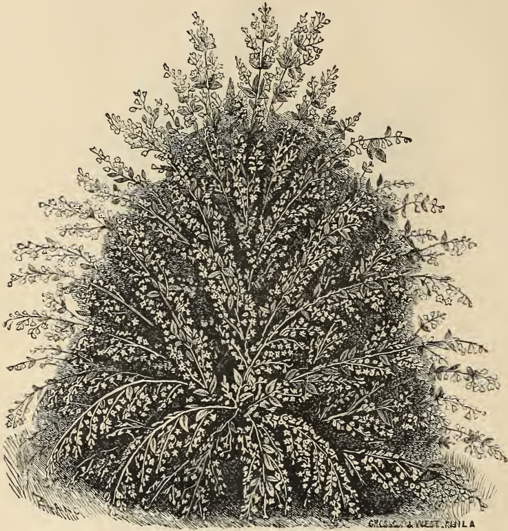
DEUTZIA GRACILIS.—(See page 25.)

situations, and requiring but little attention. They are very desirable, in fact, indispensable, in all kinds of ornamental planting, whether in door-yard, lawn, park or cemetery. They may be planted singly, or in groups or clumps, as occasion or taste may suggest. Their season of bloom lasts for several weeks, during which they are objects of striking beauty. We believe we are doing our friends a real service in offering these plants, prepaid by mail, so that they can be had at trifling expense by all.