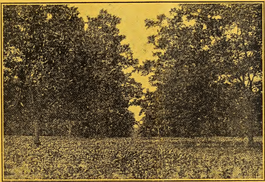
A 14 YEAR OLD PECAN GROVE

LIBRARY RECEIVED ★ AUG 24 1920 ★ U. S. Department of Agriculture