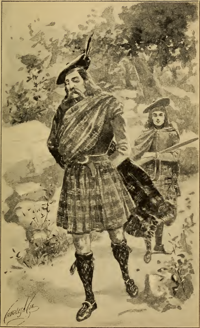
“A single page, to bear his sword.”—Page 130. The Lady of the Lake.