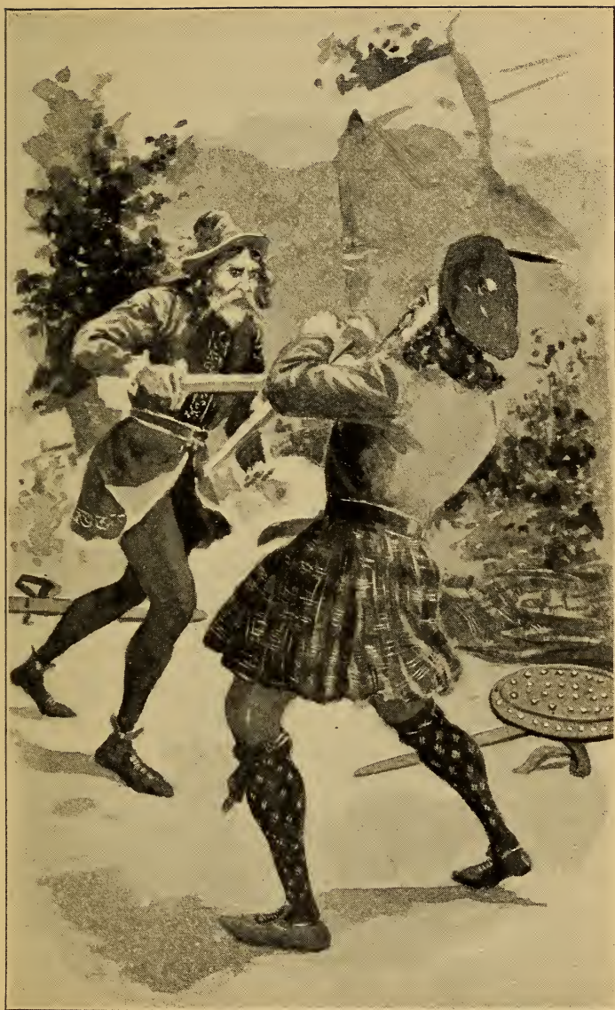
“ Three times in closing strife they stood.”—Page 193. The Lady of the Lake.