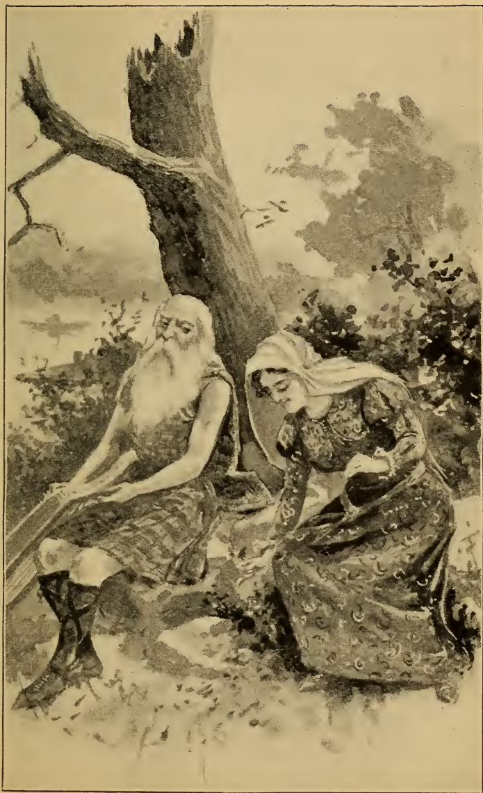
“ Plucked a blue hare-bell from the ground.”—Page 65. The Lady of the Lake.