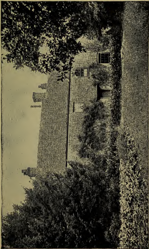
Chawton Cottage, from the Garden