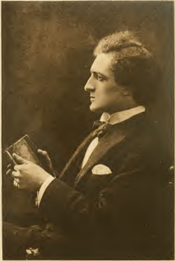
Richard Le Gallienne