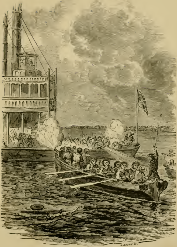
BOARDING THE WIZARD. Page 168.