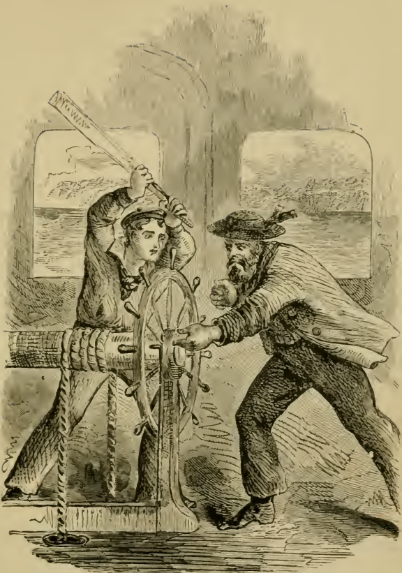
A. TRAITOR IN THE WHEEL-HOUSE. — PAGE 231.