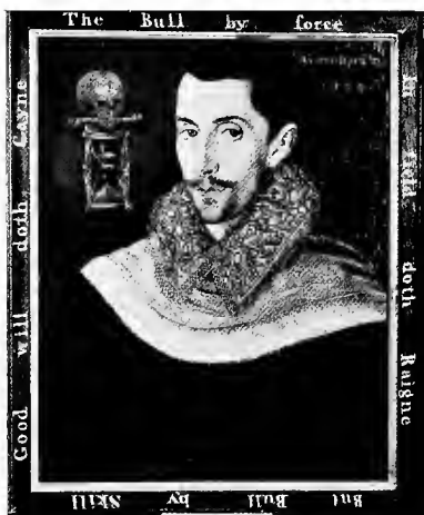
DR. JOHN BULL

From the painting in the Music School, University of Oxford.