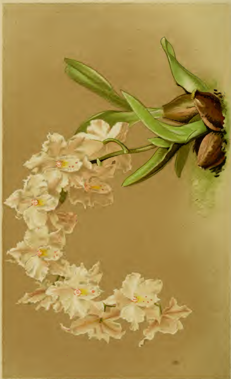
OEOBLOSSUM CRISPUM ALEXANDRAE

1 color. Botanical Magazine, London, 1860, pl. 10, fig. 2, 3, 4, 5, 6, 7, 8, 9, 10, 11, 12, 13, 14, 15, 16, 17, 18, 19, 20, 21, 22, 23, 24, 25, 26, 27, 28, 29, 30, 31, 32, 33, 34, 35, 36, 37, 38, 39, 40, 41, 42, 43, 44, 45, 46, 47, 48, 49, 50, 51, 52, 53, 54, 55, 56, 57, 58, 59, 60, 61, 62, 63, 64, 65, 66, 67, 68, 69, 70, 71, 72, 73, 74, 75, 76, 77, 78, 79, 80, 81, 82, 83, 84, 85, 86, 87, 88, 89, 90, 91, 92, 93, 94, 95, 96, 97, 98, 99, 100.