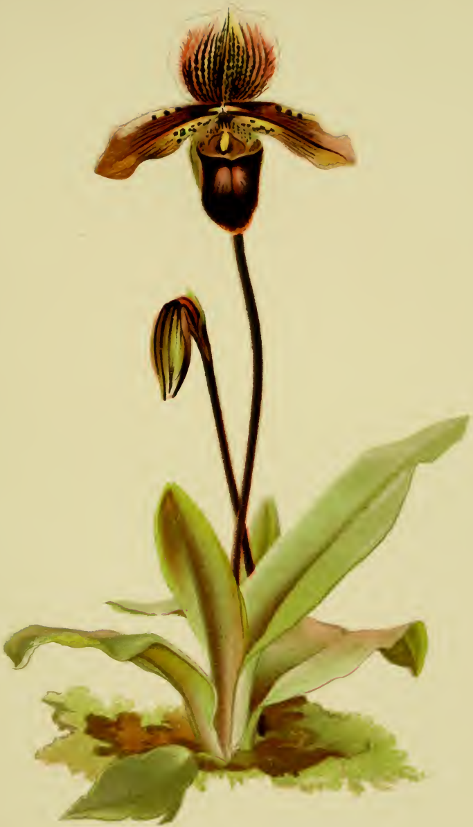
CYPRIPEDIUM HYBRIDUM POLLETTIANUM.