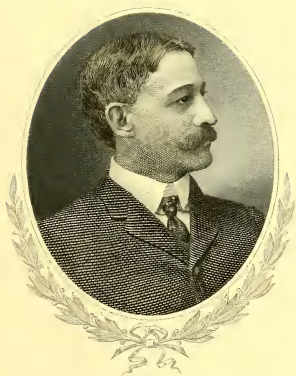
HON BENJAMIN F SHIVELY