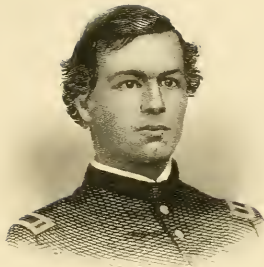
W. C. C. C. C.