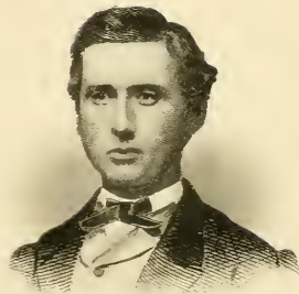
W. C. C. C. C.