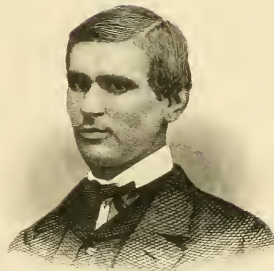
W. C. C. C. C.