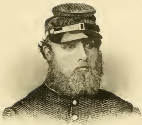
W. C. C. C. C.