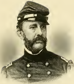
GEN. T. G. THOMAS