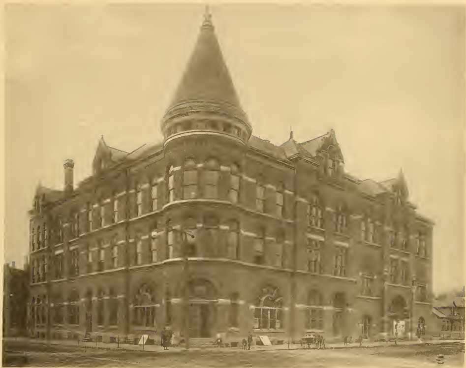
TURNHALLE AND OPERA HOUSE.