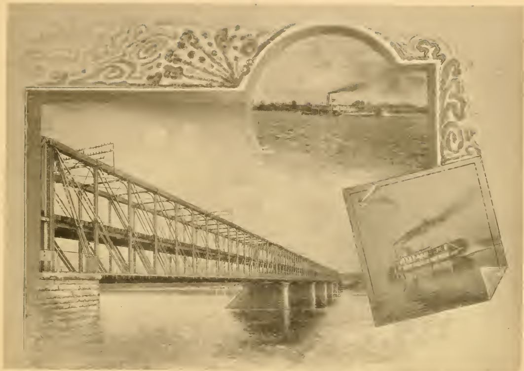
MISSISSIPPI RIVER BOATS.