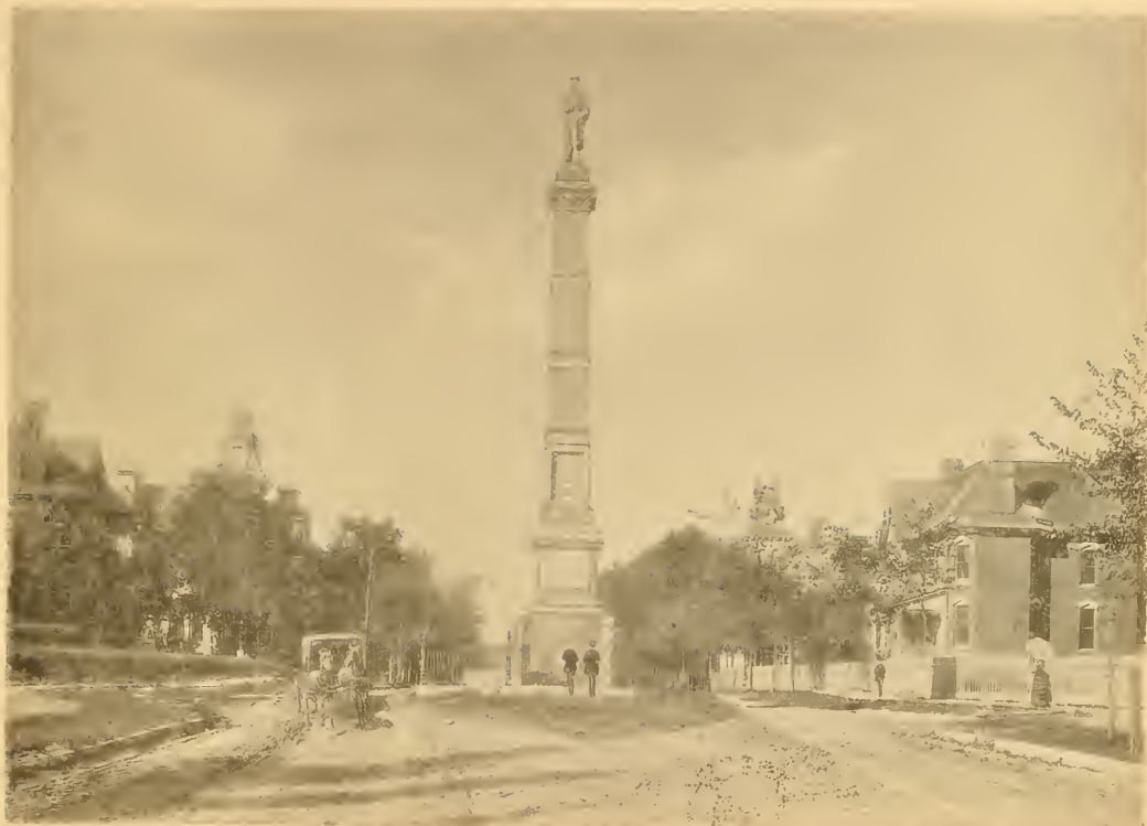
SOLDIERS' MONUMENT, MAIN STREET.