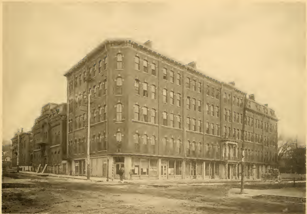
BURTIS OPERA HOUSE.