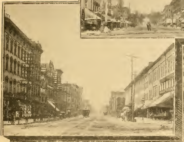
BRADY STREET, NORTH OF SECOND STREET.