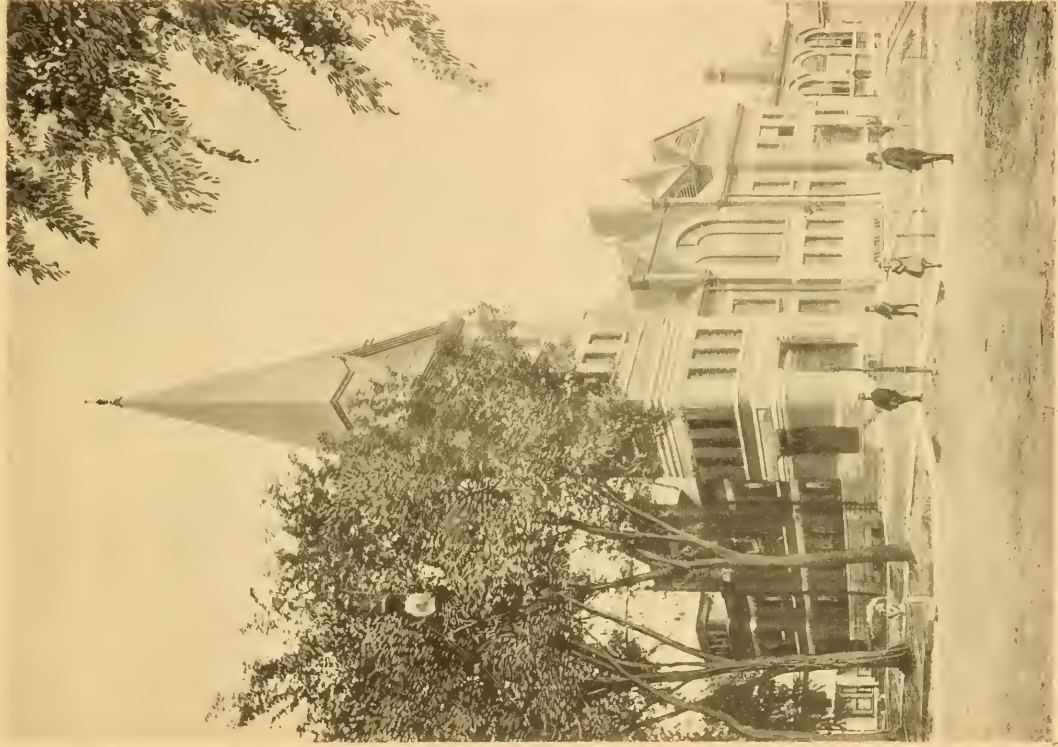
CALVARY BAPTIST CHURCH.