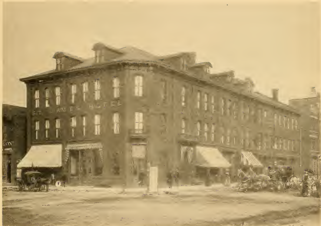
ST. JAMES HOTEL.