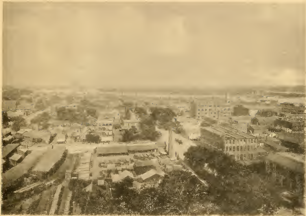
DAVENPORT, FROM COURT HOUSE.