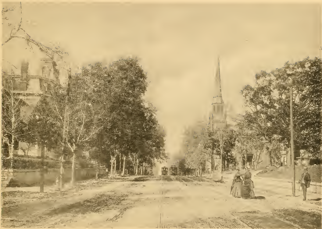
FIRST M. E. CHURCH.