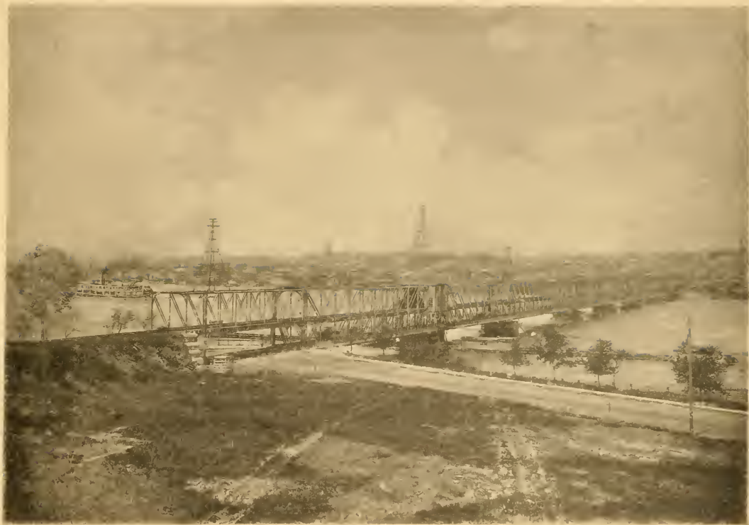
DAVENPORT, SEEN FROM ILLINOIS SHORE.