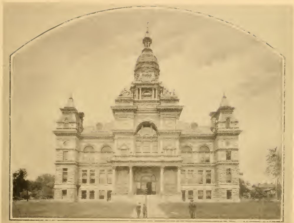
SCOTT COUNTY COURT HOUSE.