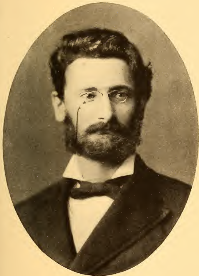
JOSEPH PULITZER AT THE AGE OF THIRTY-FOUR