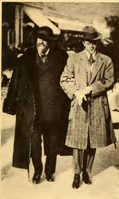
JOSEPH PULITZER AT MONTE CARLO, 1911