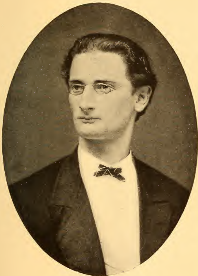
JOSEPH PULITZER AT THE AGE OF TWENTY-THREE