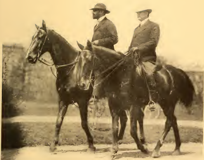
JOSEPH PULITZER IN 1902, RIDING IN CENTRAL PARK WITH A SECRETARY