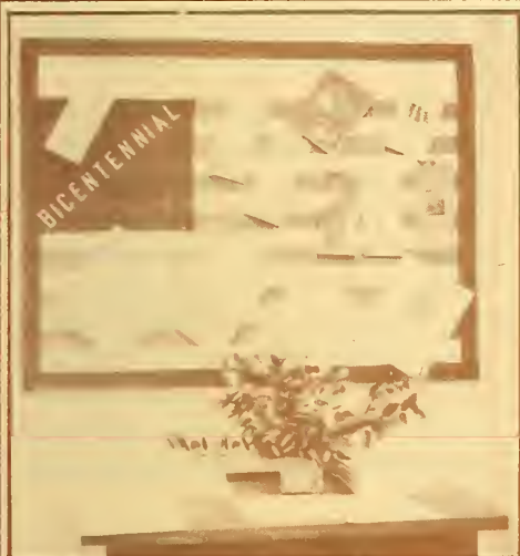
An attractive Bicentennial Display of Government Documents catches the eye of visitors to the North Carolina State Library in Raleigh.