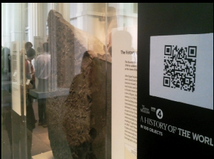
Terence Eden, Lizenz: CC-BY-SA 3.0