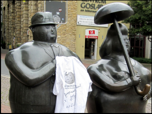
Fernando Botero, „Mann mit Stock“ + „Frau mit Schirm“.