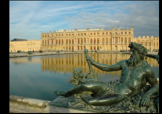
Marc Vassal Lizenz: CC-BY-SA 3.0