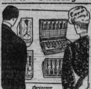
Table and Dessert Knives, best Sheffield blades and celluloid and ivory handles, from $5.00 to $12.00 per dozen.

Fish and Dessert Knives and from $20.00 to $40.00 per dozen pairs; Silver-Plated Spoons and Forks from $4.00 to $12.00 per dozen. Fin Carvers and Meat