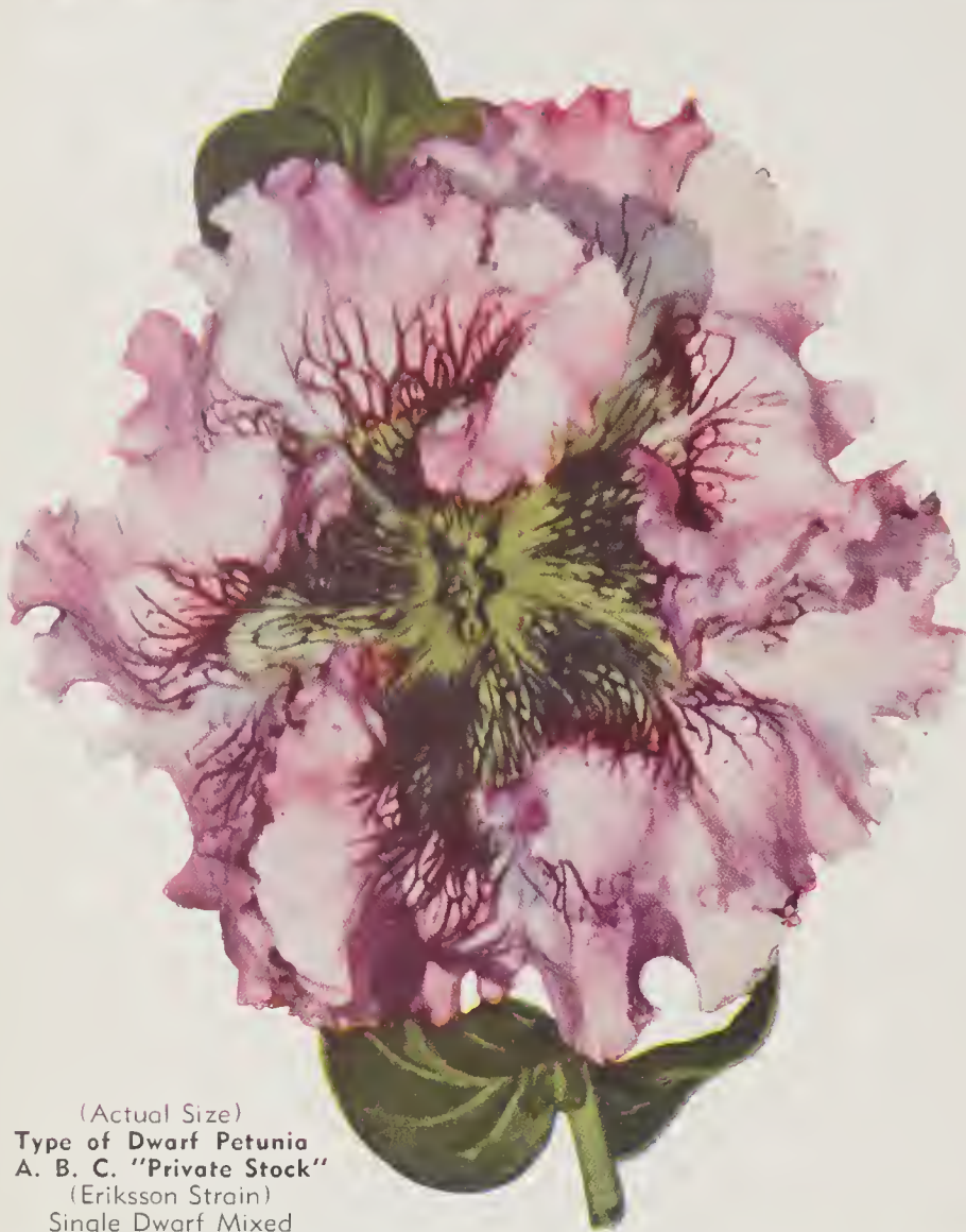
(Actual Size) Type of Dwarf Petunia A. B. C. "Private Stock" (Eriksson Strain) Single Dwarf Mixed