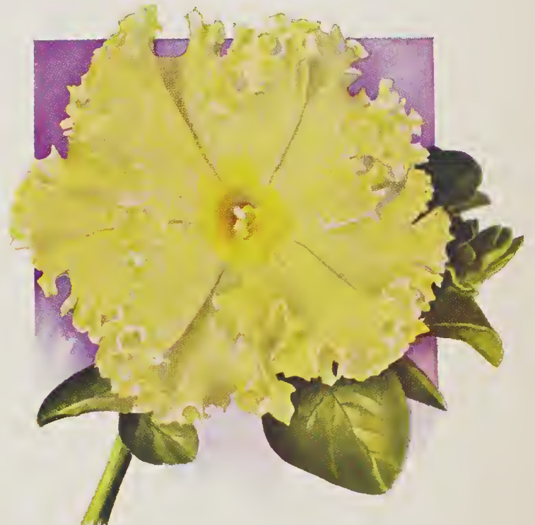
Petunia, "Dainty Lady." Tr. pkt., $1.00.