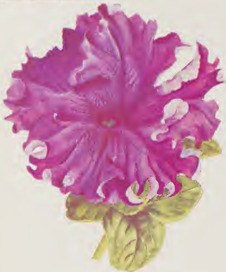
New Petunia, "Angela" Extra Dwarf Single Fringed, a Most Pleasing Shade of Velvety Violet-Blue Tr. pkt. $1.00, 1/32 oz. $3.50