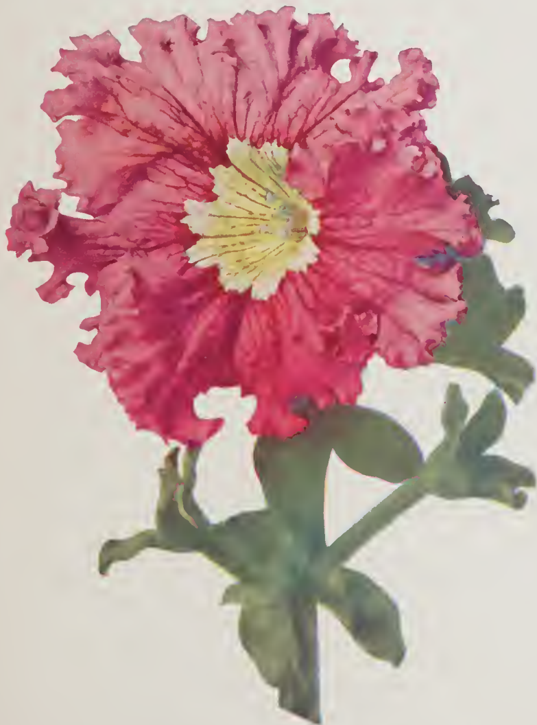
"Theodasio", Rose-Pink with Golden Center, Very Large and Exquisitely Fringed, Very Beautiful Tr. pkt. 50c, 1/64 oz. $1.00, 1/32 oz. $1.75