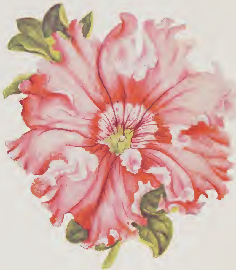
New Petunia, "Mantebello" Extro Dwarf Single Fringed Beautiful "Lo France" Pink Tr pkt. $1.00, 1/32 oz. $3.50