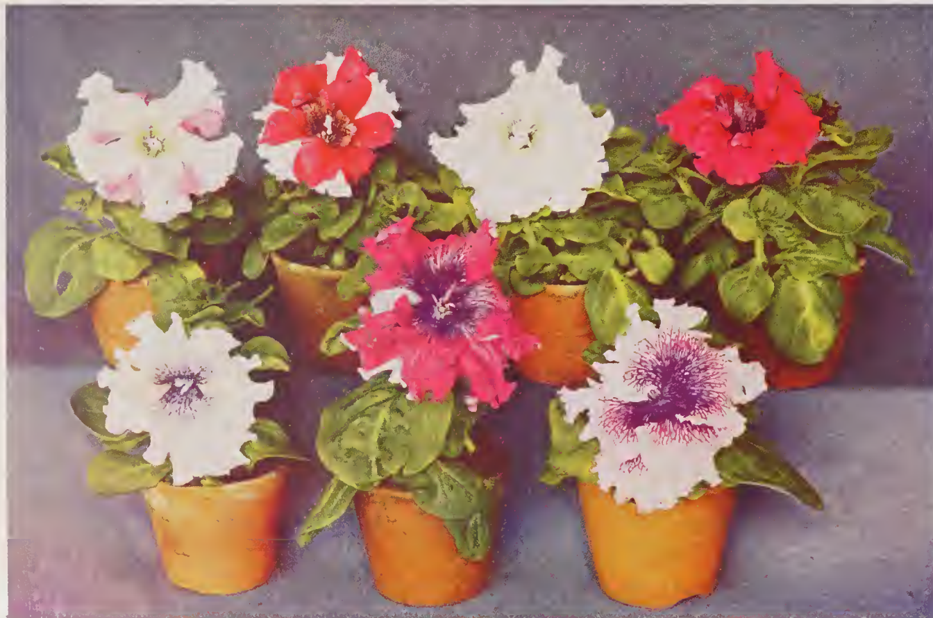
Illustration Opposite Shows But a Few of the Multitudinous Colors Obtaining in This Exclusive Strain. See Above for Actual Size of Flower. From a Photograph. A. B. C. "Private Stock" Mixture Has No Competitor In Its Respective Class. Exclusively Supplied by American Bulb Co.