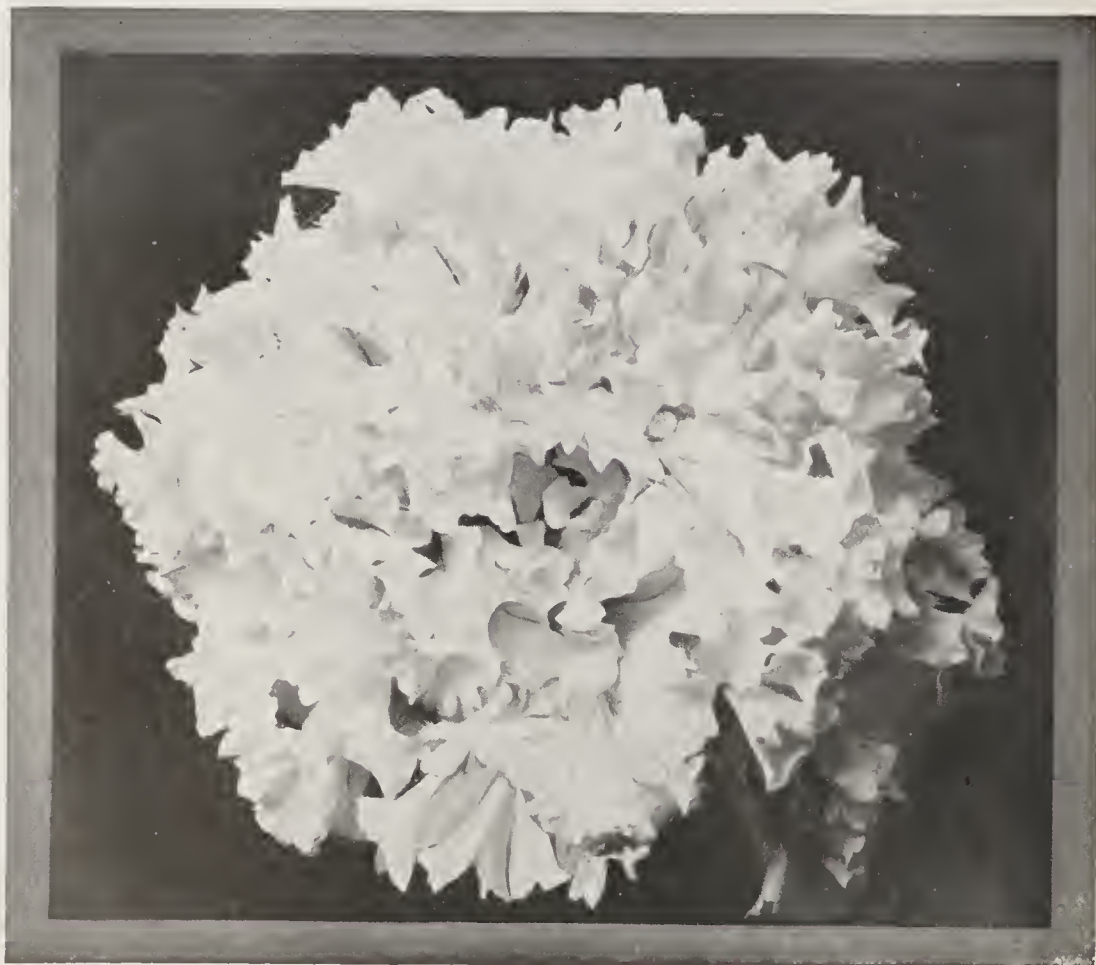
Type of Petunia A. B. C. "De Luxe" Dwarf Large-Flowering Double Mixture Exceptional for Pot Plants and Bedding

Another 100 per cent double flowering Petunia of extraordinary merit. Individual flowers are not so large as the maximum type offered opposite. However, this mixture is more dwarf and branching. Height 13 inches. Ideal for pots and bedding Mixed Colors, tr. pkt. ....$1.50