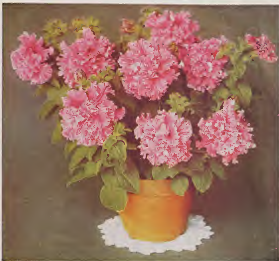
New Double Flowering Fringed Petunia, "World Beauty" Original Strain (Named and Introduced by the American Bulb Company)