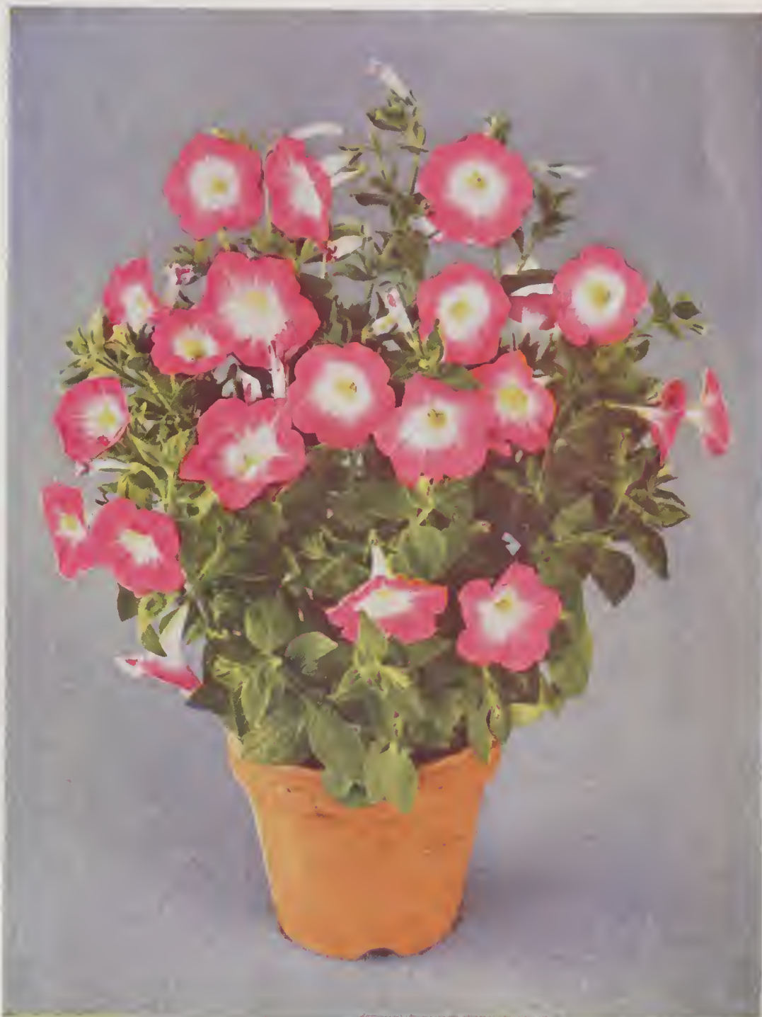
Petunia, Hybrido Nona "New Rosy Morn" Improved A Valuable Addition to This Dwarf Family Tr. pkt. 35c, 1/8 oz. $1.50, 1/4 oz. $2.75, 1 oz. $10.00