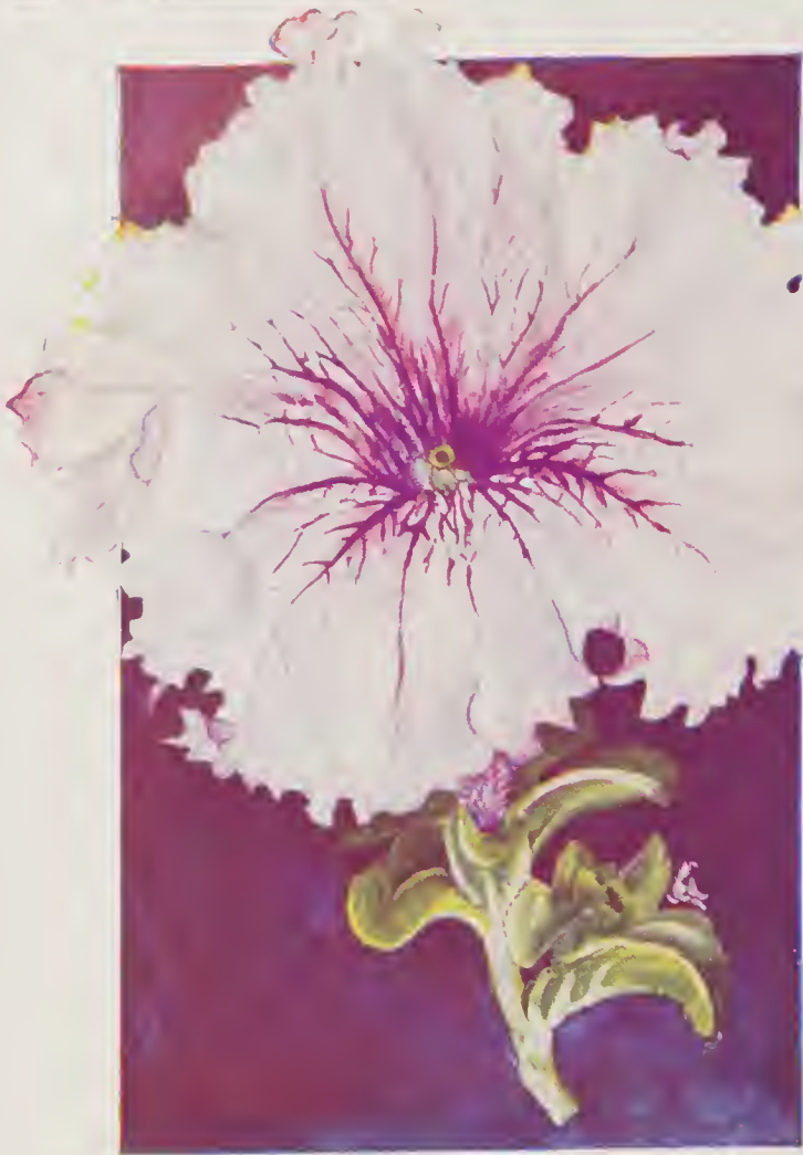
New Petunia, "Mars" Extra Dwarf Single Fringed Tr. pkt., $1.00; 1/32 oz., $3.50.