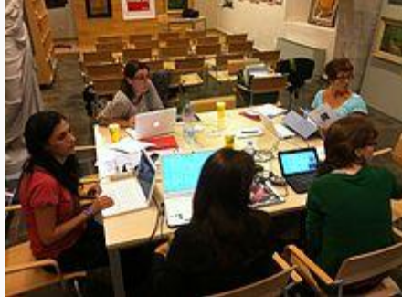
Weekly WikiClub at the Friends of the Art Museum of Girona