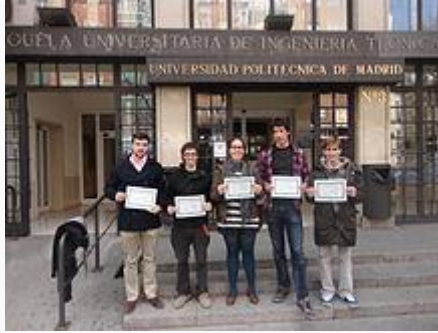
2012 Viquifabricació winners with their diplomas