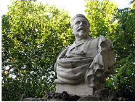
One of the pictures uploaded during WLPA