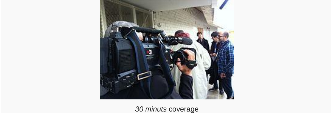
30 minuts coverage