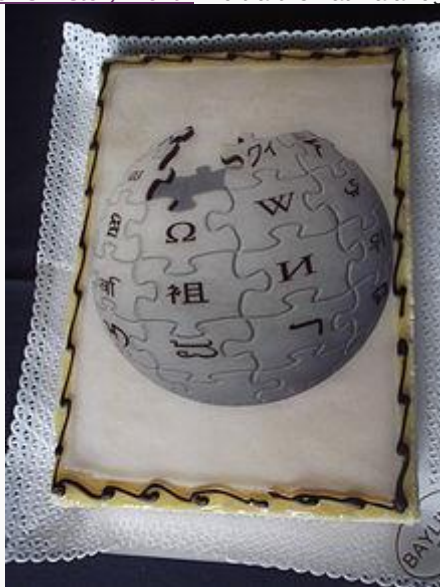
Catalan Wikipedia cake celebrating its 12th anniversary