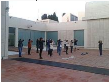
Yoga during Fundació Miró's edit-a-thon