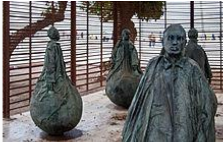
Una habitació on sempre plou, by Juan Muñoz in Plaça del Mar, winning photo of Wiki Loves Public Art Barcelona