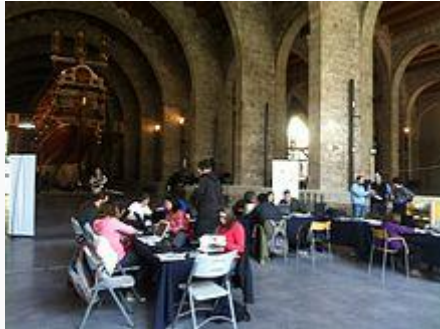
Edit-a-thon at Drassanes