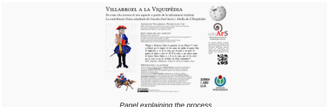
Panel explaining the process