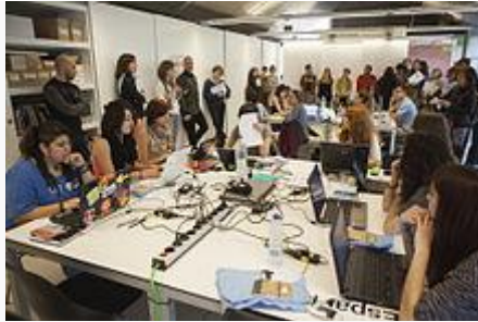
Espai 13 edit-a-thon