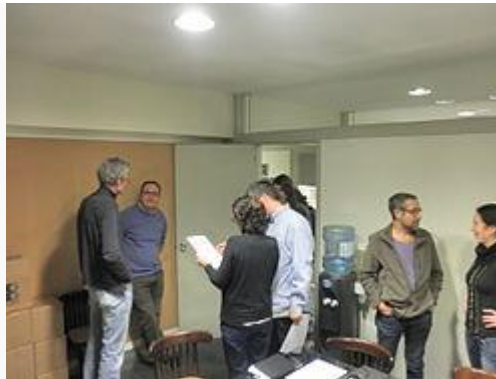
People from School of Art of Tarragona, Nacional Arqueological Museum and Dvdgmz talking off-topic after a WikiArS meeting.