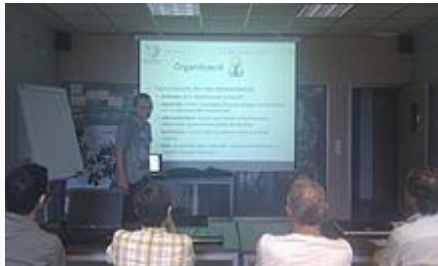
Workshop in Betxí, Valencian Country