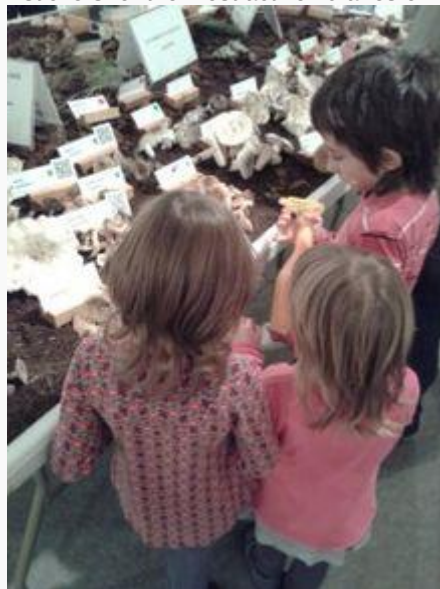
QRpedia at Mataró Museum