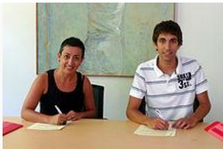
Catalan Institute of Women's president, and Amical's president sign the agreement