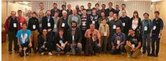
Group photo of Viquitrobada 2013 (Wikimeeting)