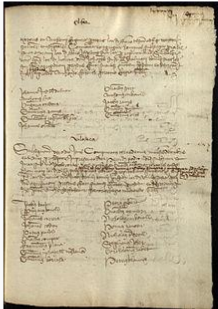
Original page of the 1448 book "Llibre del Sindicat de Remença" (Peasant Syndicate Book), totally scanned in Wikimedia Commons