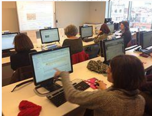
GLAMwiki workshop for librarians from Barcelona