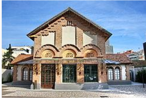
Art Museum of Cerdanyola