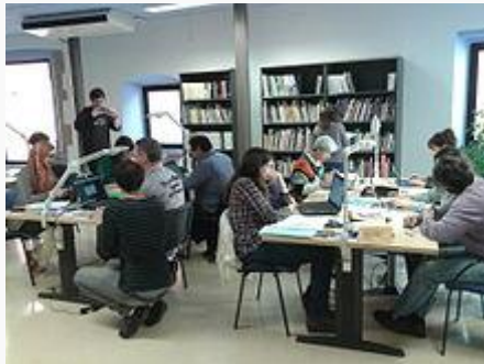
WikiWomen's History Month : Edit-a-thon at Palafrugell Archive