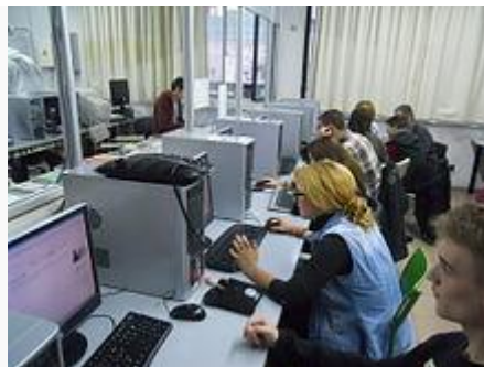
Scientific illustration Edit-a-thon