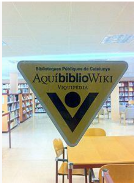
BiblioWiki stickers for the most active libraries on Wikipedia