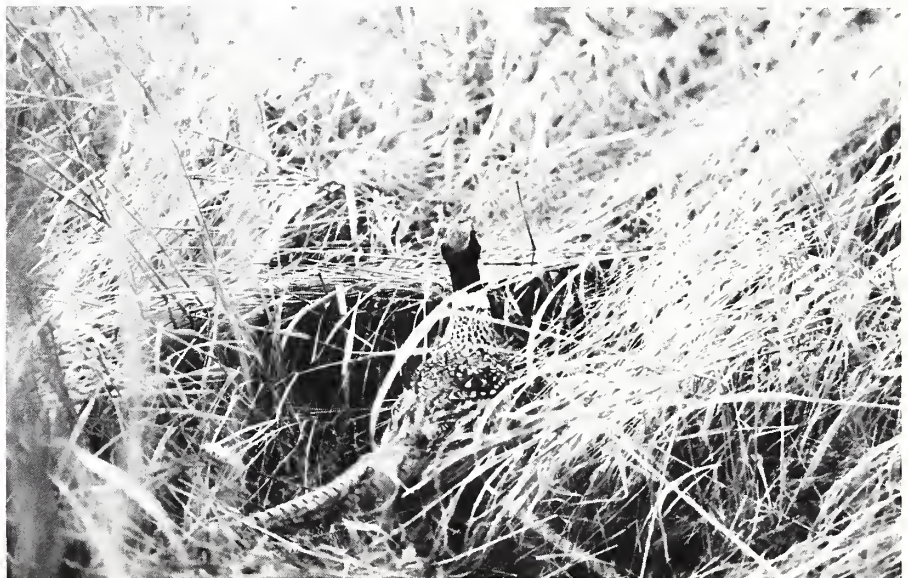
Pheasant finds ready cover in stand of switchgrass.

Bishop says CRP land is more valuable for wildlife than a field in alfalfa rotation because the alfalfa is mowed for hay during the peak nesting season. Under normal conditions, CRP plantings are left undisturbed after they are mowed the first summer to control weeds.