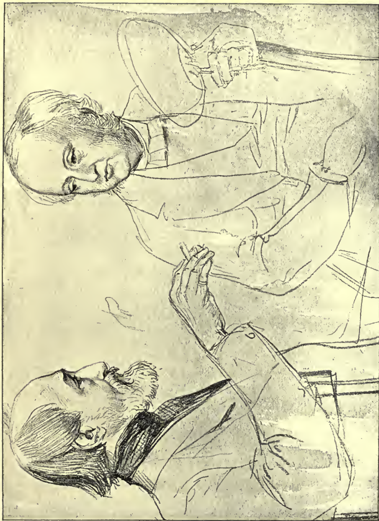
J. MAZZINI AND PROFESSOR JOWETT