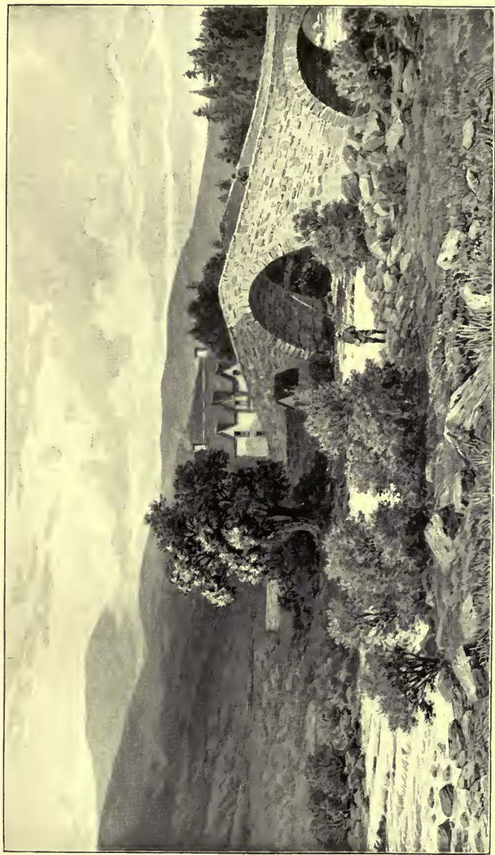
TUMMEL BRIDGE AND INN, PERTHSHIRE