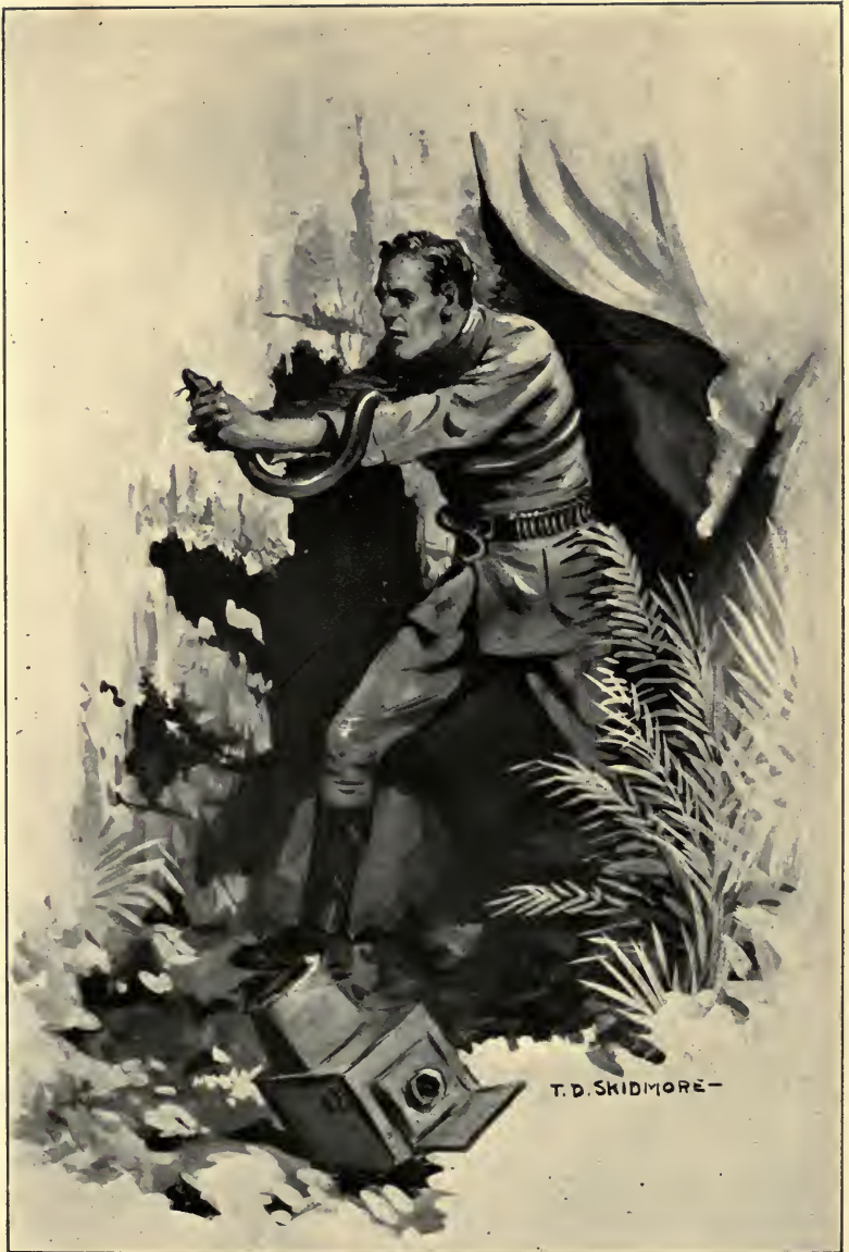
IT WORKED ITS TRIPLE SET OF FANGS BACKWARD AND FORWARD IN A VAIN EFFORT TO BURY THEM IN MY HAND