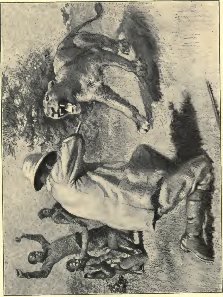
I FIRED POINTBLANK INTO HER BREAST