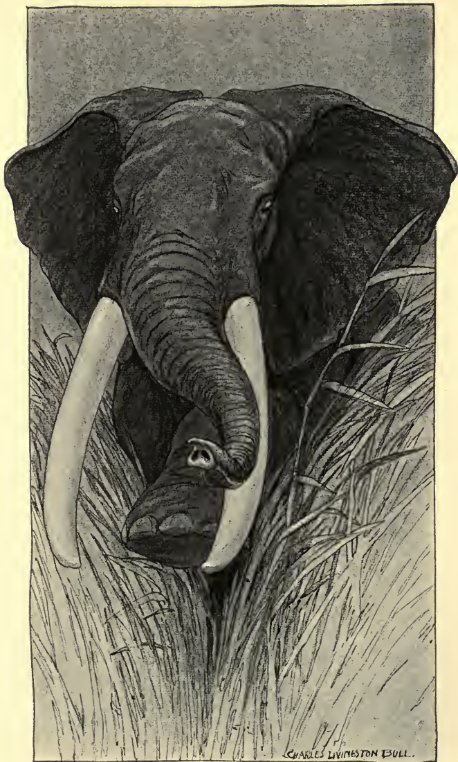
THE GRASS PARTED AS THOUGH A SNOW-PLUGH WERE BEING DRIVEN THROUGH IT