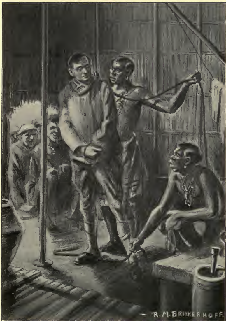
HIS GUARDS BOUND HIS HANDS AND FEET