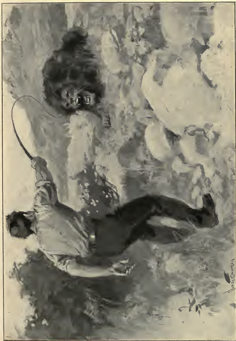
THE WHIP-LASH ALL BUT CUT HIM IN THE FACE