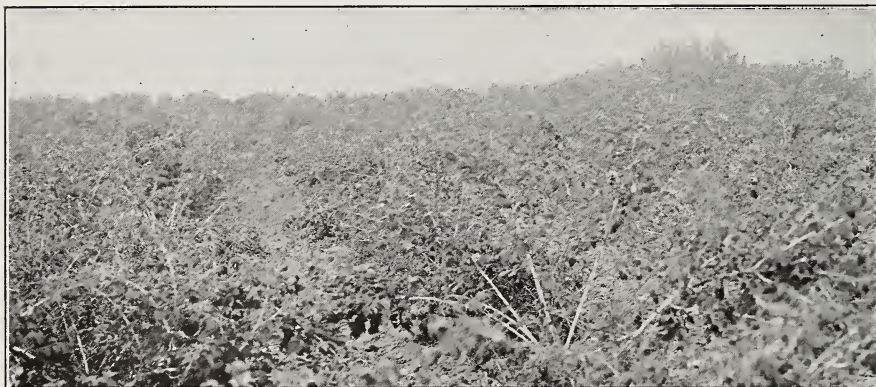
A large field of Cumberland Raspberry, from which we grow our plants