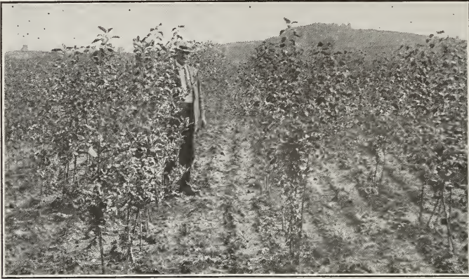
Block of coming two year APPLE, containing over 100,000 trees. Note excellent growth.