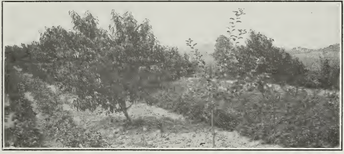
Section of one of our Apple Orchards, showing Peach Trees as fillers, two years after planting. Potatoes used as mulch crop.

See catalogue as to different kinds and descriptions of same.