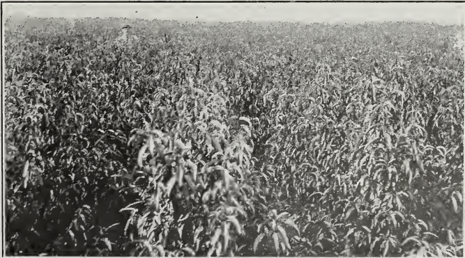
Section of one of our Blocks of one year budded Peach, containing a half million trees. Photographed in July. Note magnificent growth.

5 at 10 rates, 50 at 100 rates, 500 at 1,000 rates