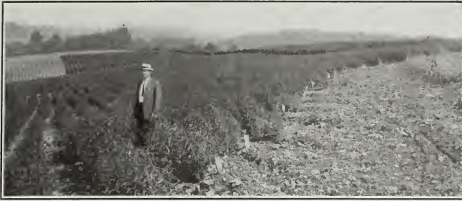
View of several hundred thousand Peach Seedlings. Block of budded Peach Trees in Background