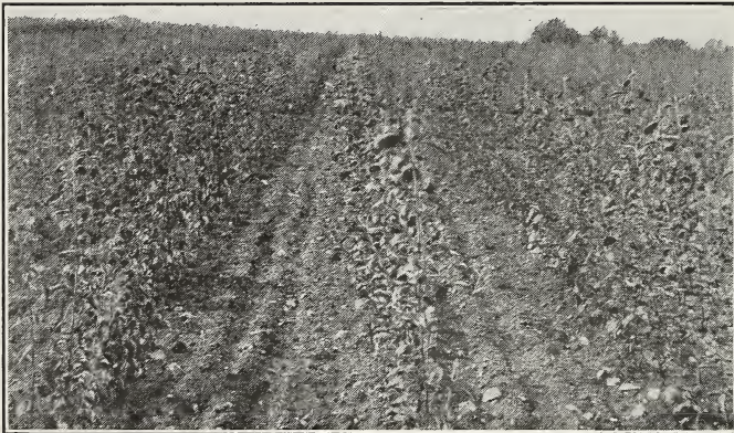
One of our large blocks of one year budded Apple. Photographed in July. Note excellent stand and growth.